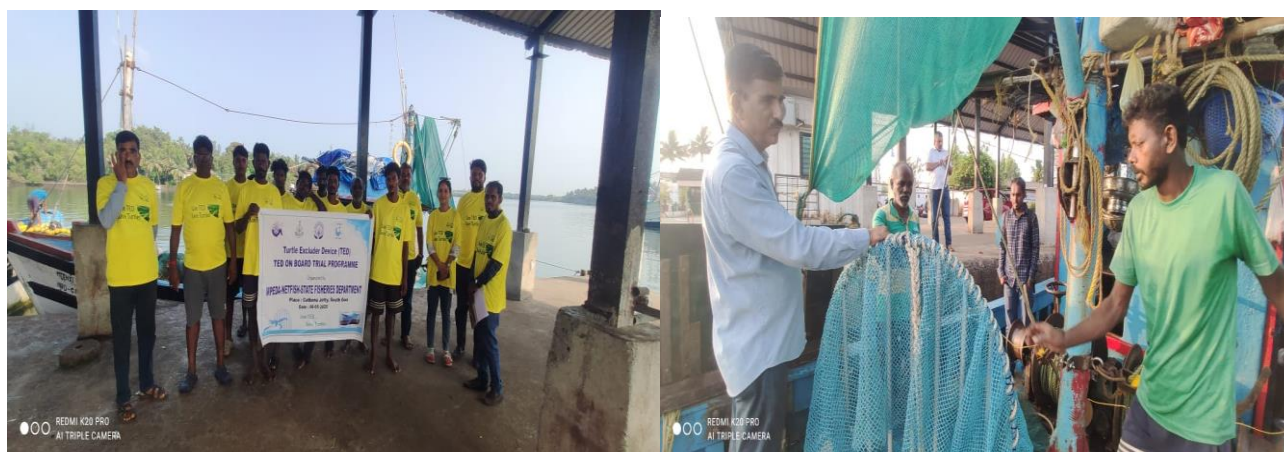
TED On board trial program at Cutbone jetty