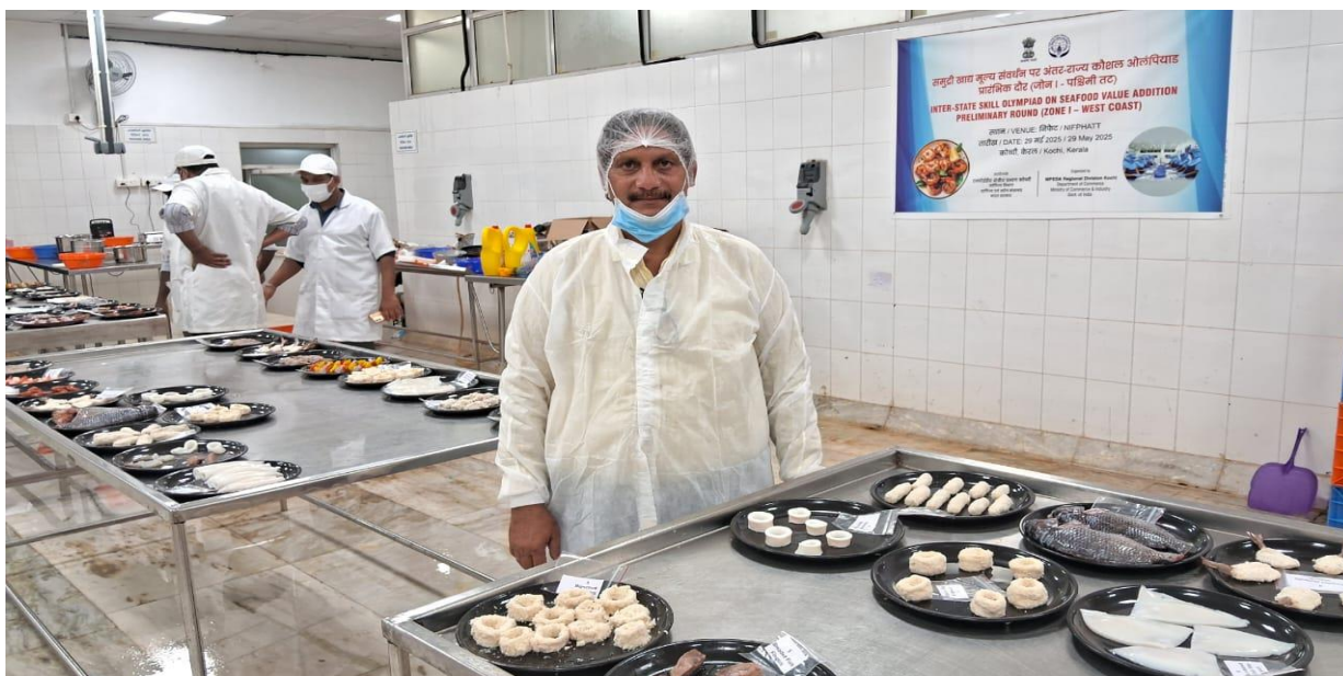
Attended as Trainer in Seafood Olympiad on Value Added Products at NIFPHATT, Kochi