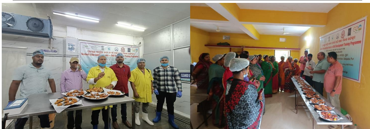
PPA Funded Seafood value addition training program

Two-day hands-on training program conducted at Chilka region for 25 fisherwomen SHG members to develop skills for employment in seafood export units and promote self-reliance under Atmanirbhar