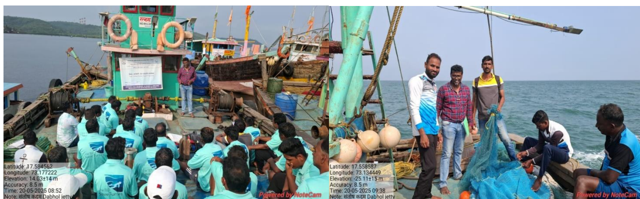
TED Awareness & On board Trial program at Dhabol