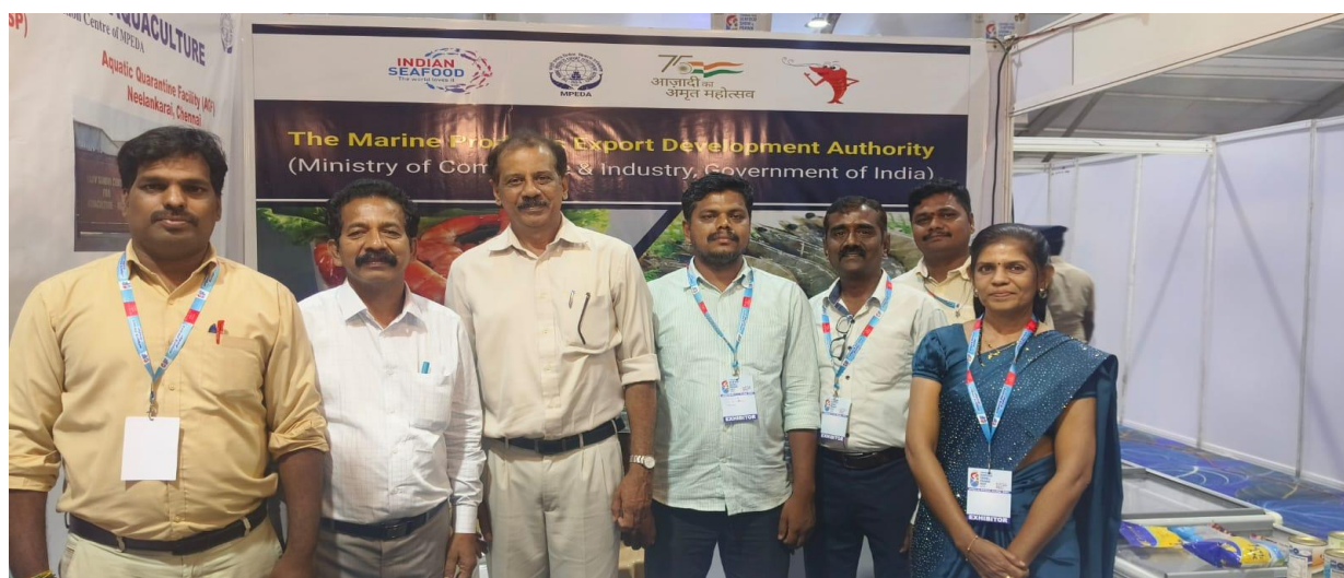
Participation in Seafood Show organized by Tamil Nadu Fisheries Department