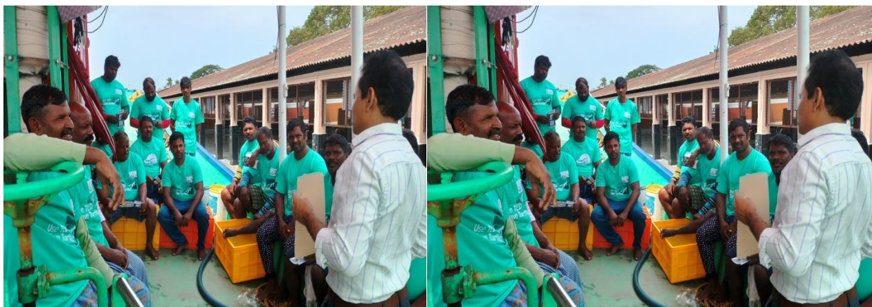
TED Awareness program at Munambam