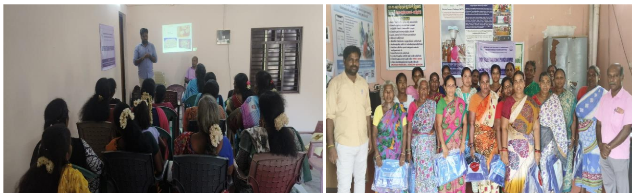
Dry fish awareness at Puducherry