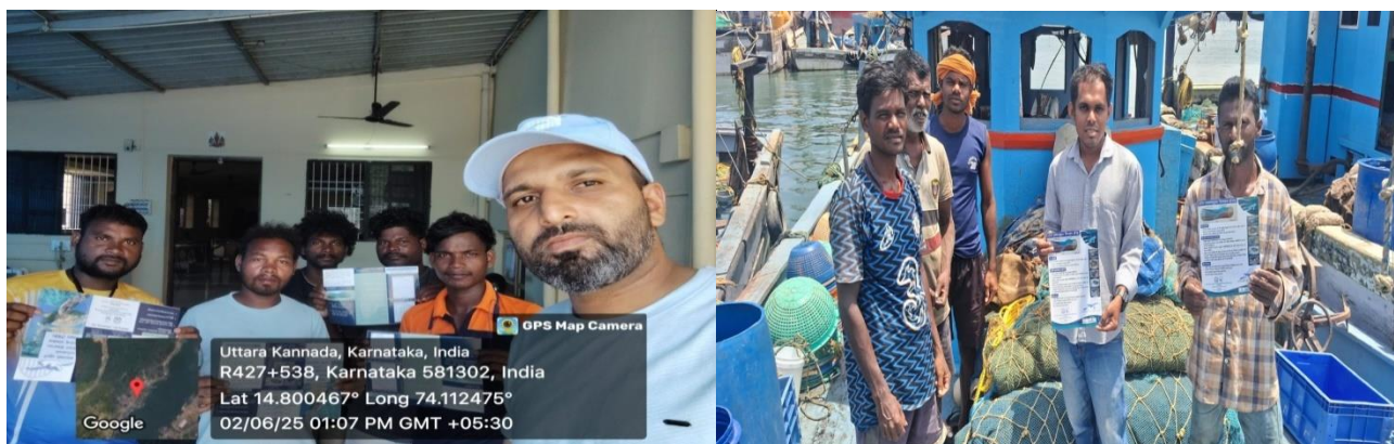
Awareness by HDCs

Also, the HDCs pasted TED awareness stickers in Hindi on trawl fishing vessels.