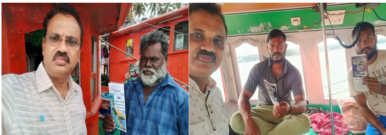
Boat to boat campaign at Munambam & Munakkakadavu