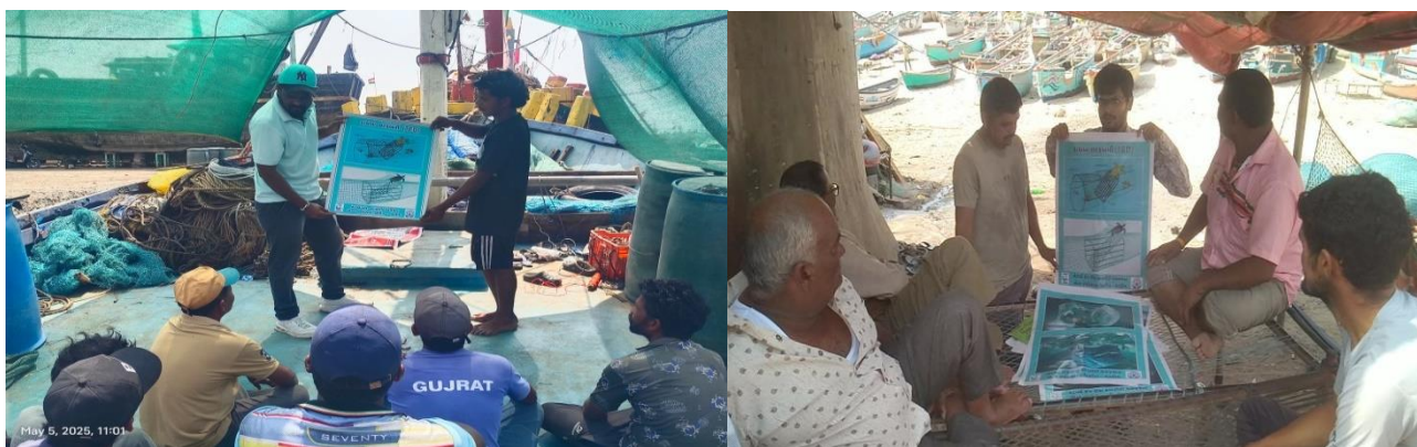
Awareness by HDCs