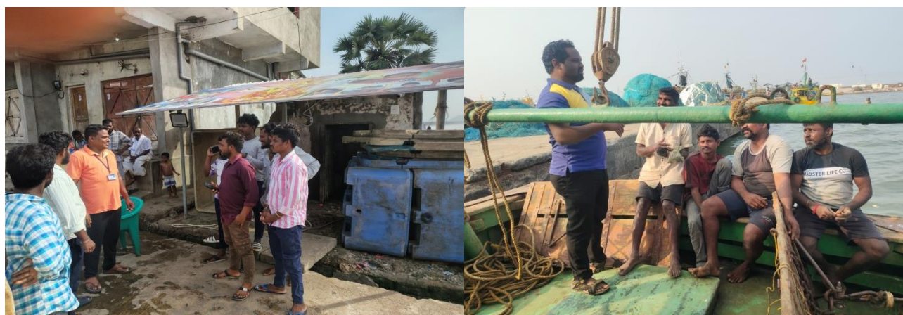
Awareness by HDCs