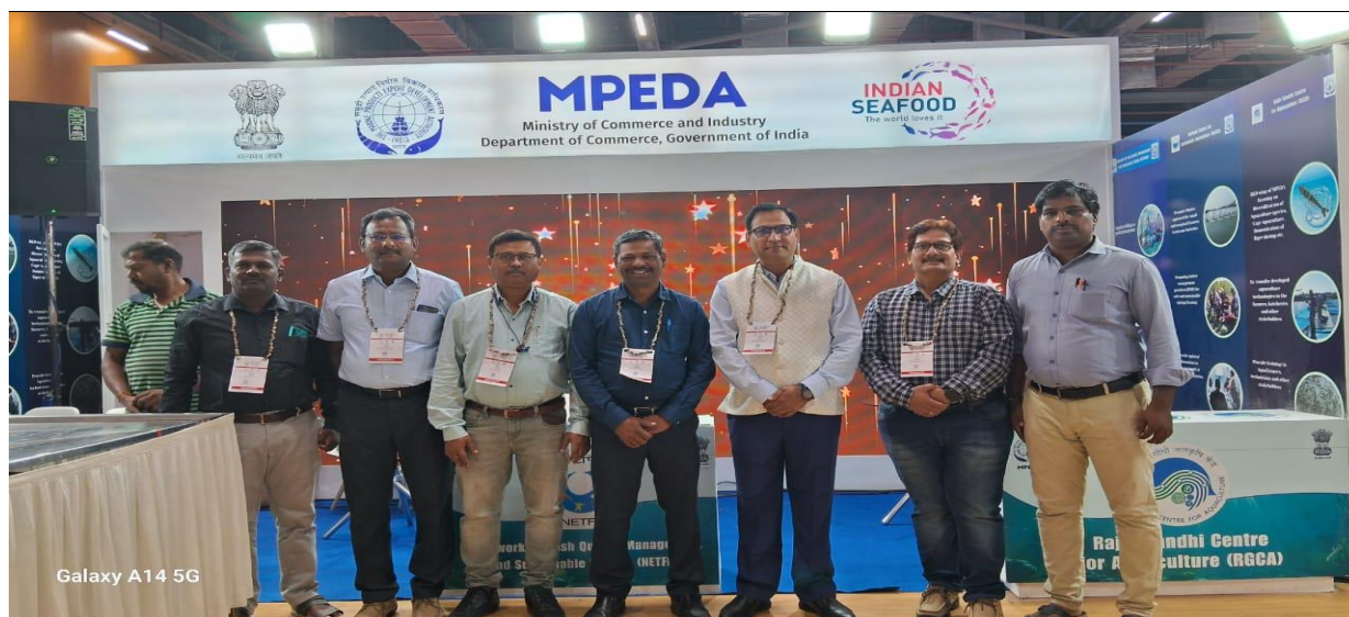
Participation of SCO in final round of Skill Olympiad at Chennai