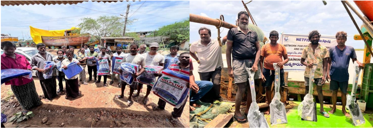
Fishing Harbour Based program at Machilipattinam & Gilakaladini