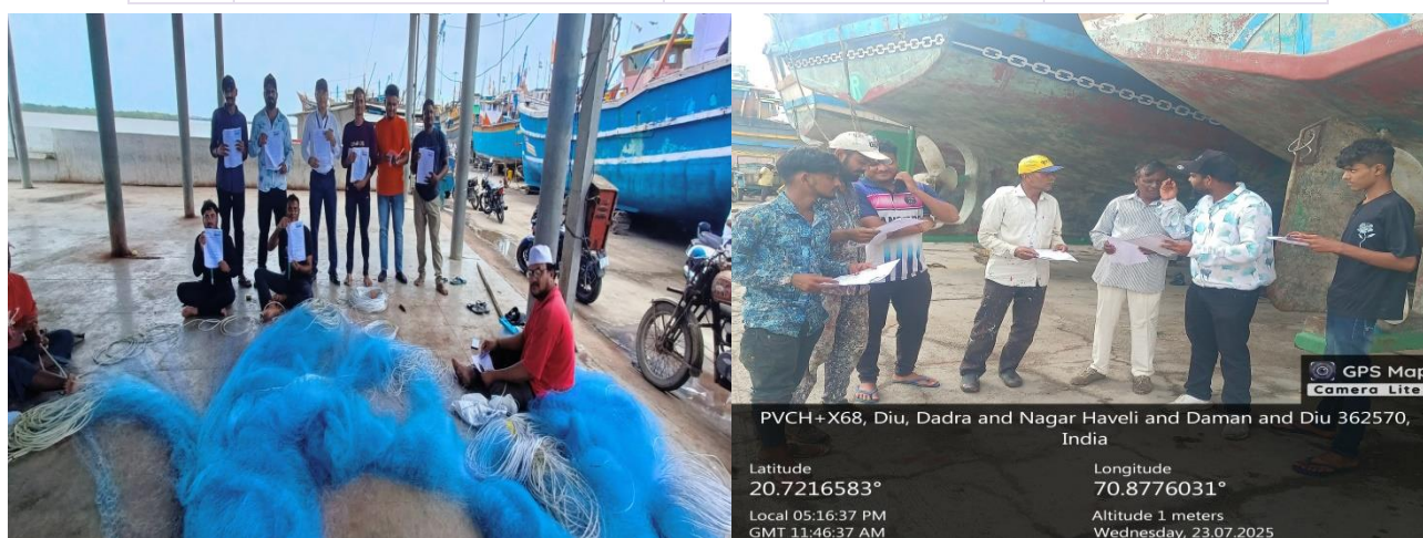
Door to door campaign on TED