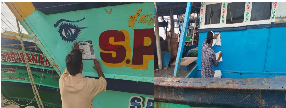
Pasting TED stickers at fishing vessels