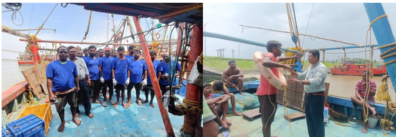
Fishing Harbour based program at Deshapran & Shoula