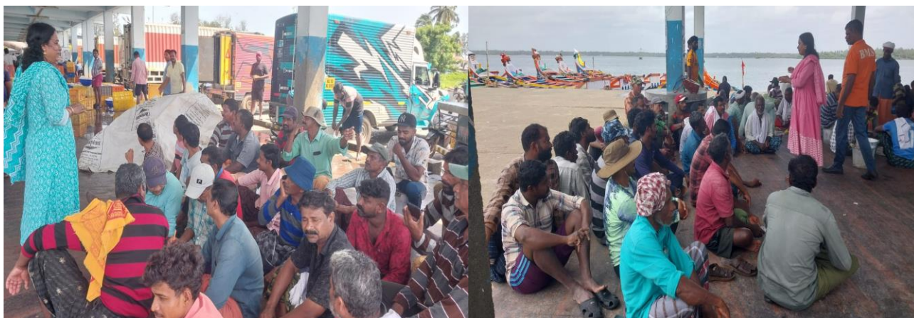
Fishing Harbour based programs at Azheekkal Kayamkulam