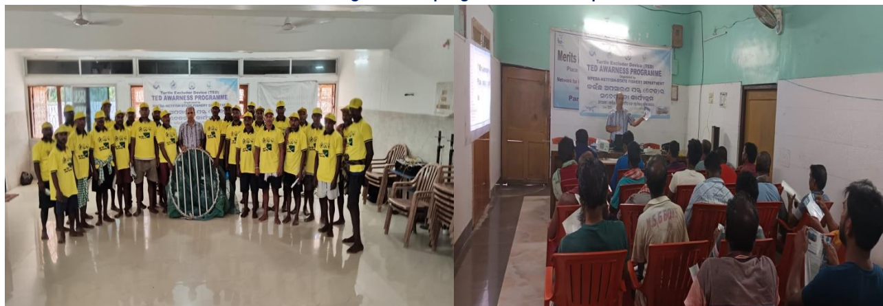
TED Awareness program at Paradeep & Balramgadi