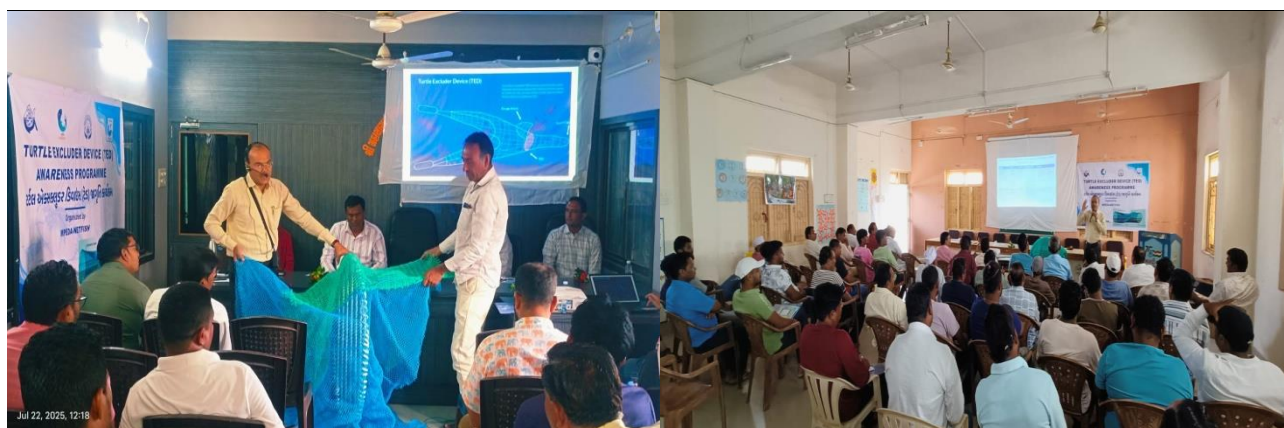
TED awareness program at Vanakbara