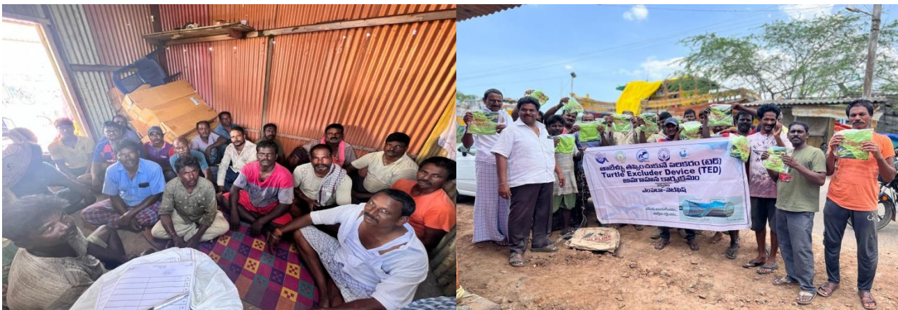
TED awareness program at Machilipattinam