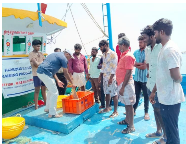
Harbour based program at Tharuvaikulam