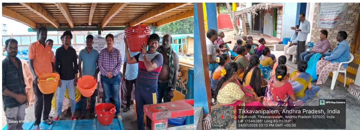
Fishing Harbour based program at Vizag & Pudimadaka