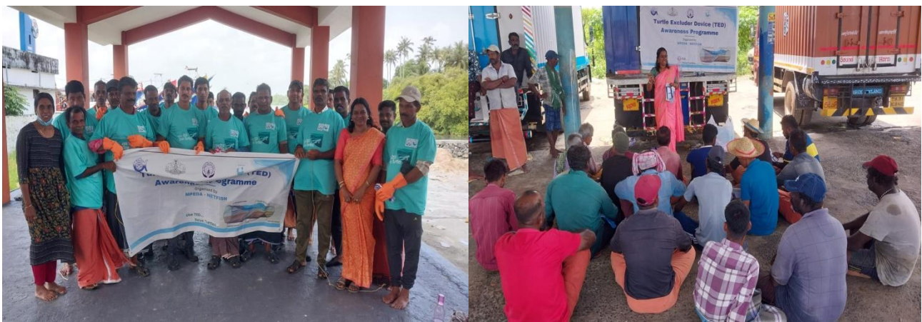
TED Awareness program at Azheekkal Kayamkulam & Thottappally