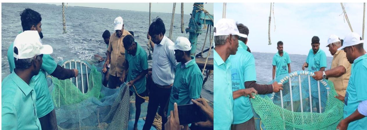
TED On-board Trial program at Karaikkal FH