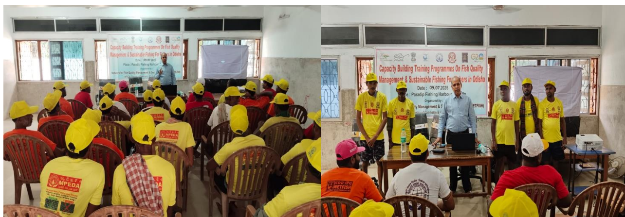
Fishing Harbour program at Paradeep