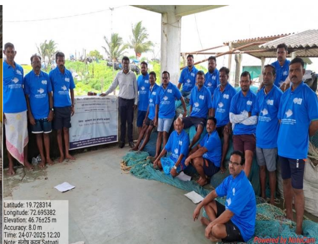
Fishing Harbour based program at Uttan &amp; Satpati