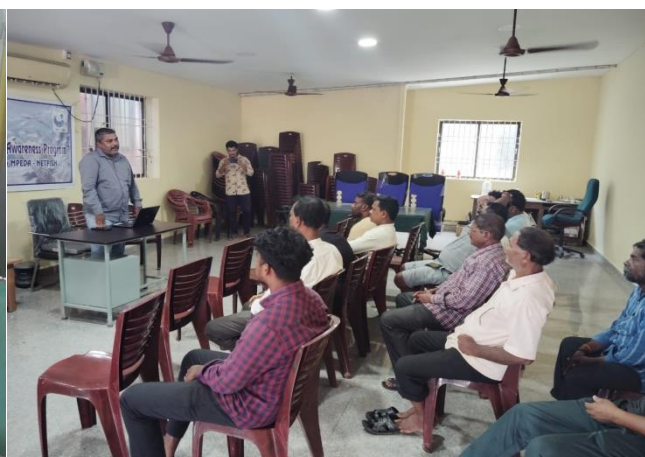
TED Awareness program at Bhatkal

No. of Harbours with Whatsapp Groups: 10