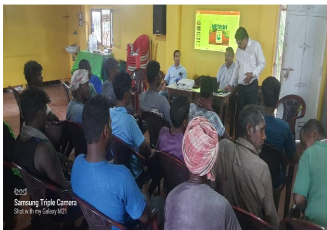
Harbour program at Honnavar