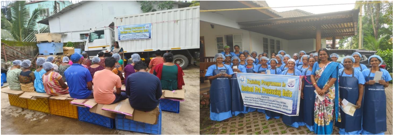
Pre-processing centre program at Edakochi & Chandiroor