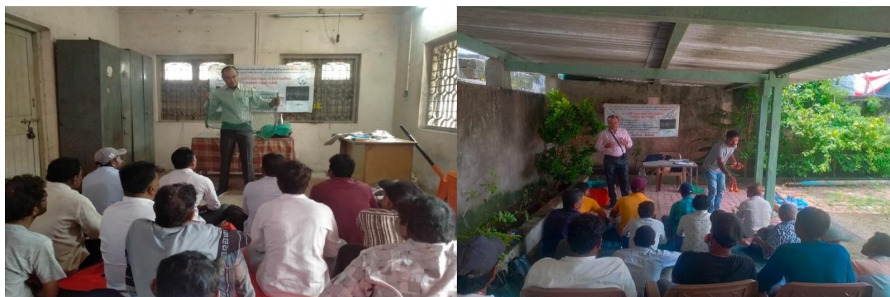
Fishing Harbour based program at Veraval