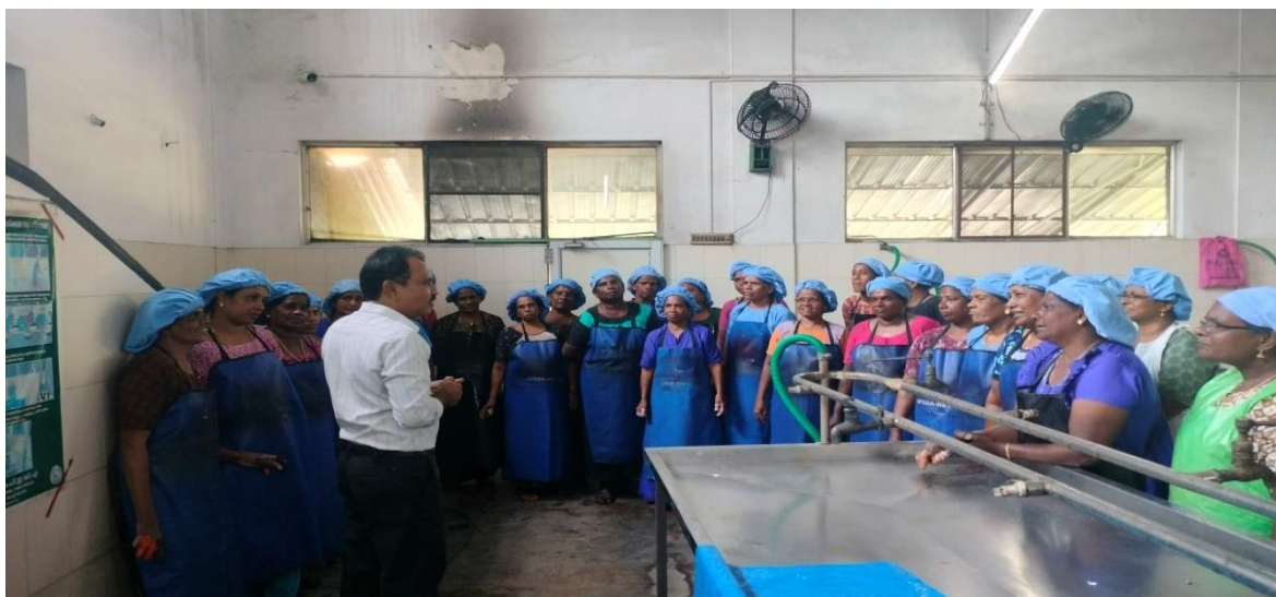
Preprocessing center program at Edavanakkad