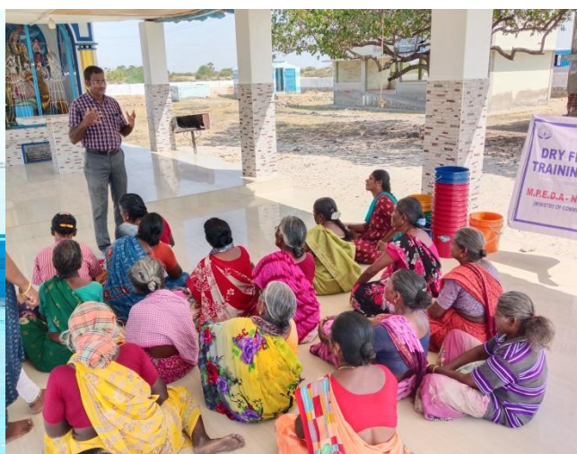
Dry fish program at Vellapatti