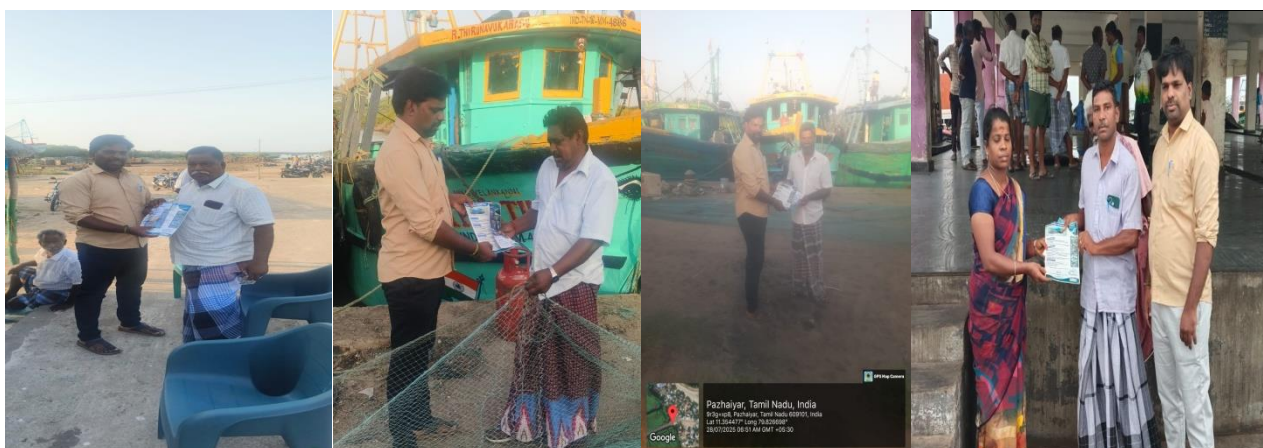
Boat to boat campaign on TED