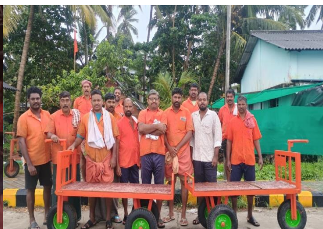
Fishing Harbour program at Puthiyappa

No. of Harbours with Whatsapp Groups: 9 Total No. of Whatsapp groups formed at Harbours: 10 Total No. of members in the Whatsapp groups: 1380