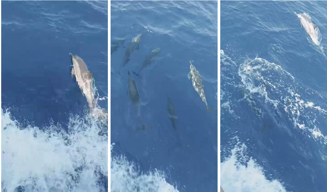
Spinner dolphins sighted off Gujarat