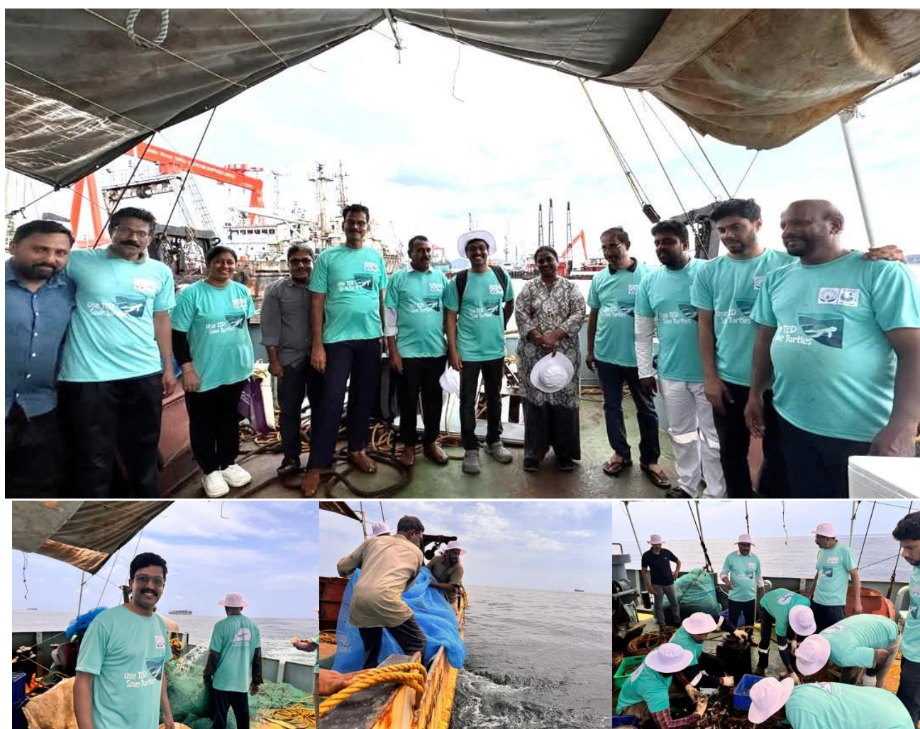
Chairman MPEDA participates in the TED trial conducted onboard CIFT vessel