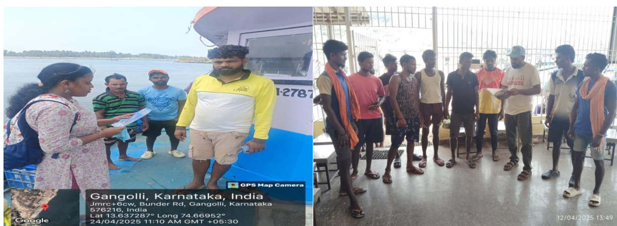
Awareness by HDCs