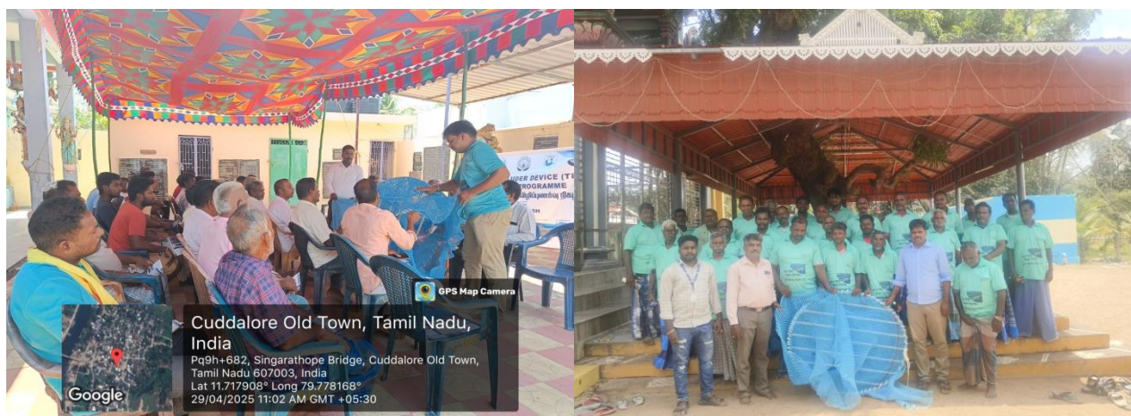
TED Awareness program at Cuddalore