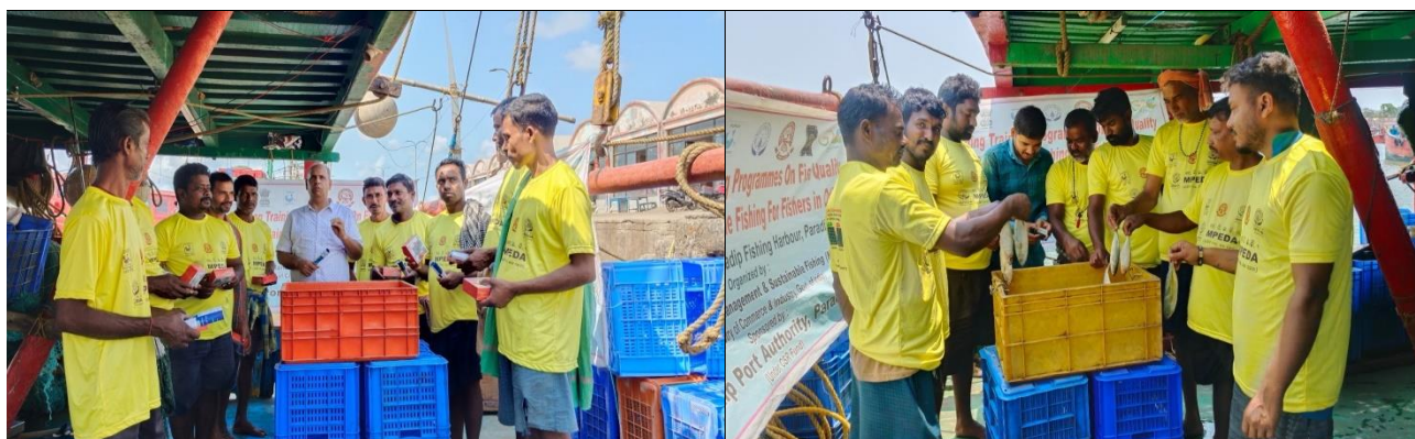
Paradeep Port Trust funded fishing vessel program at Paradeep FH