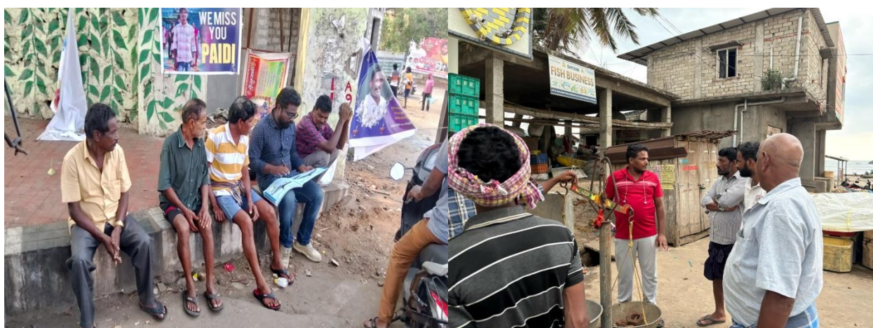
Awareness by HDCs