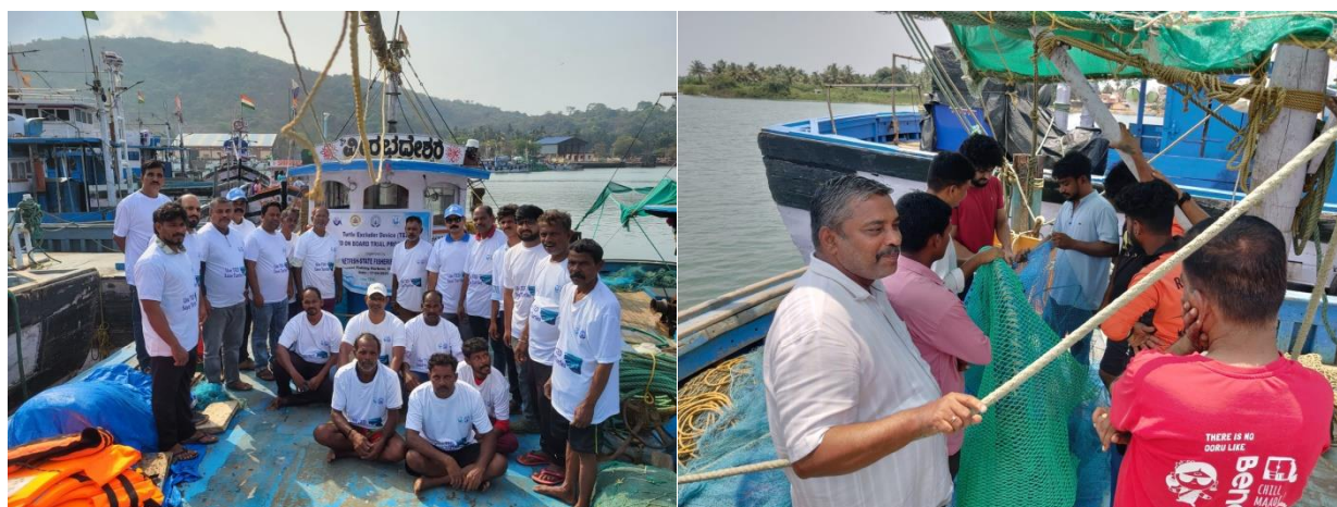
TED onboard trial program at Karwar & Bhatkal

No. of Harbours with Whatsapp Groups: 10 Total No. of Whatsapp groups formed at Harbours: 17 Total No. of members in the Whatsapp groups: 702