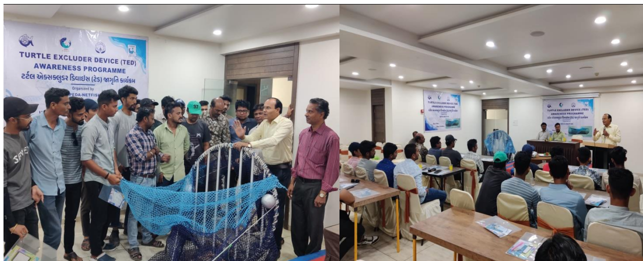
TED Awareness program at Veraval