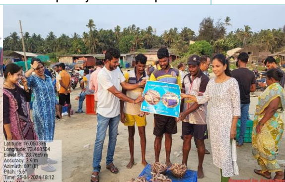
Awareness by HDCs