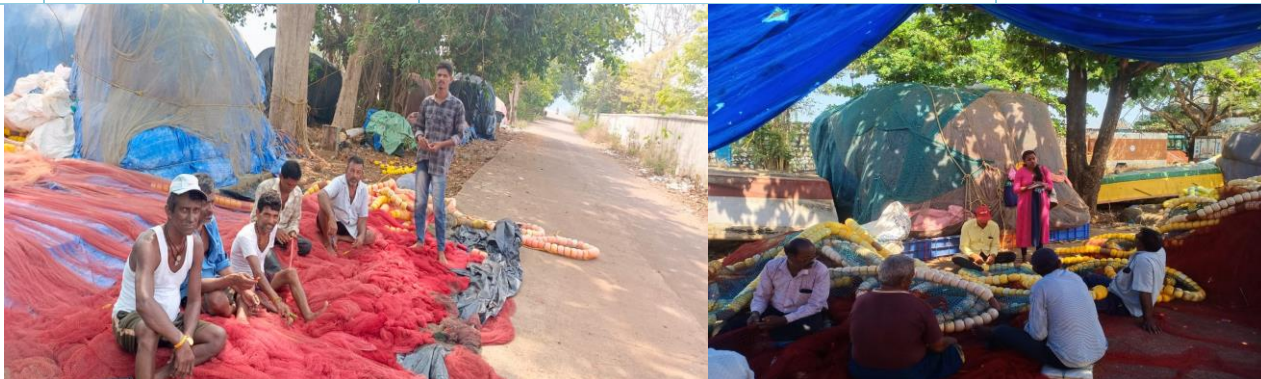
Awareness by HDCs