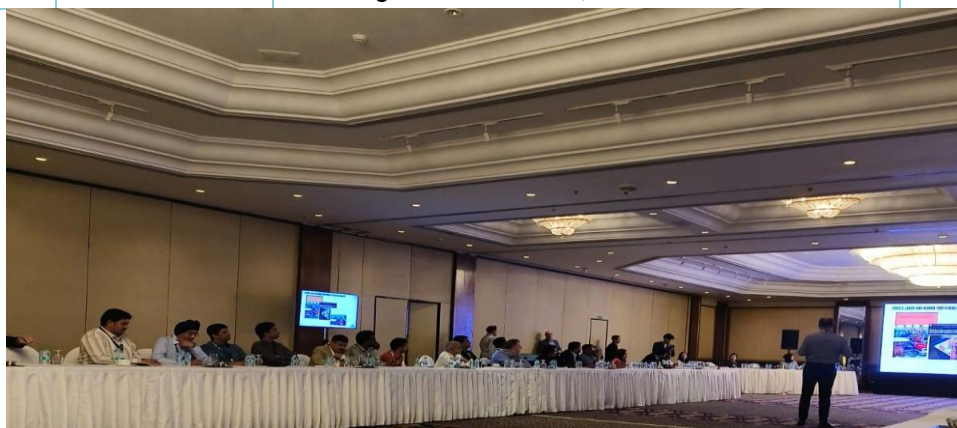
SCO attended Global level Seafood Taskforce Meeting at Hotel Leela, Mumbai