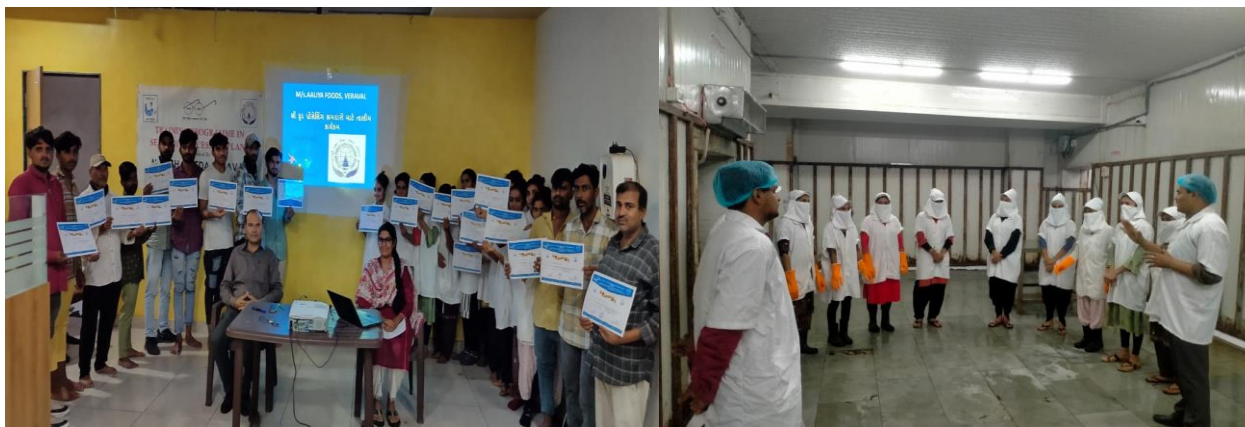
Seafood Processing Centre program at Veraval