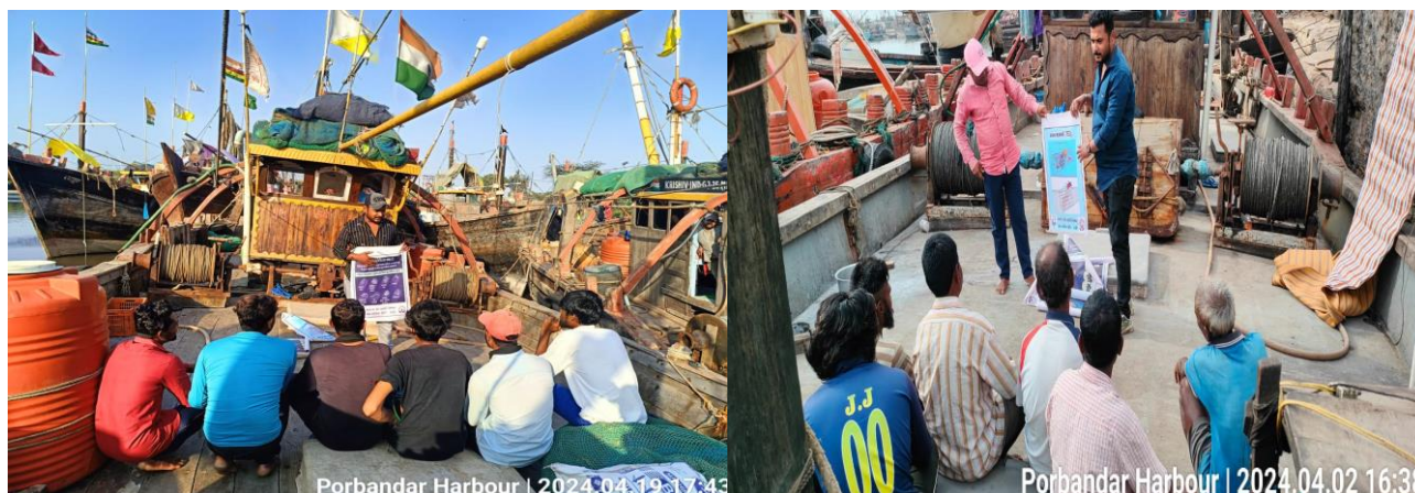
Awareness programs by HDCs