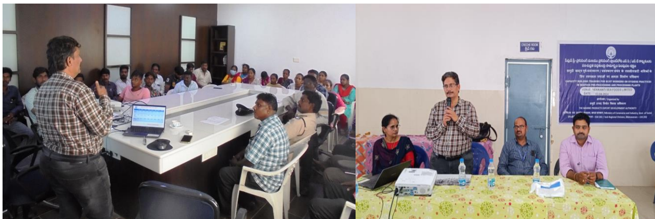
Seafood Unit Training program to SC/ST workers