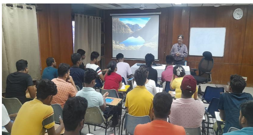
Awareness class on 'Fish Quality Management in Seafood export' to Fisheries students from West Bengal