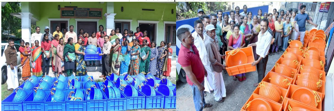
MPEDA Funded Fishing Harbour based program and Fishermen aid distribution