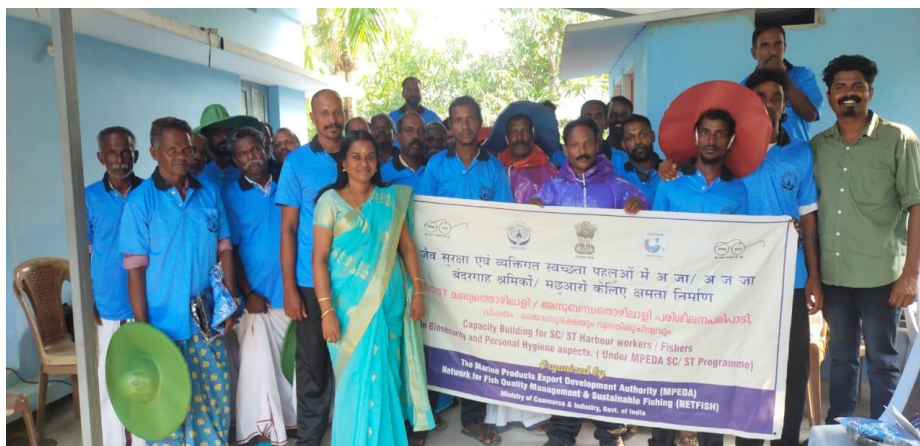
RD MPEDA SC Fund- Fishing Harbour based program