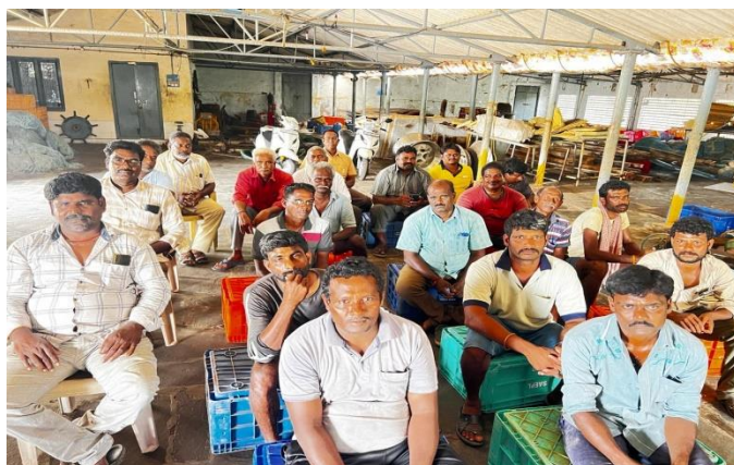
Fishing Harbour based program at Machilipattinam