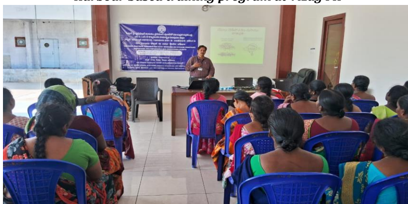
RD MPEDA SC-Seafood Training program at Amalapuram