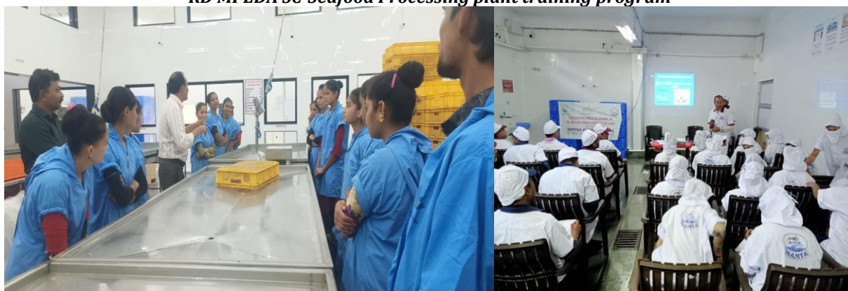
Seafood processing centre programs