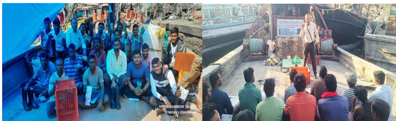
Fishing Harbour based program at Mangrol & Porbandar