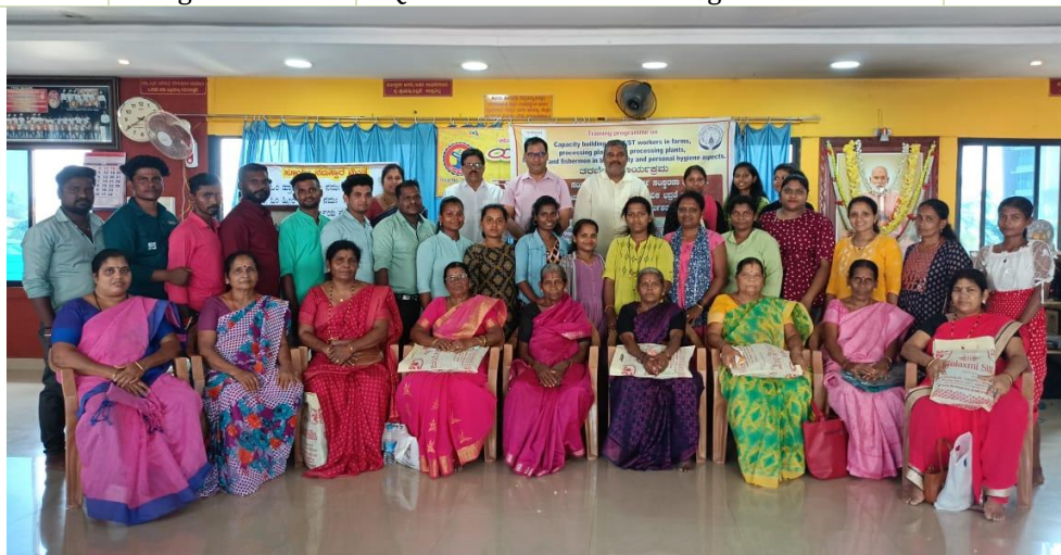
MPEDA Funded Fishing Harbour based training program at Ankola