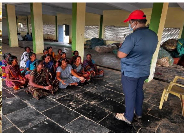
Dry fish program at Vodarevu