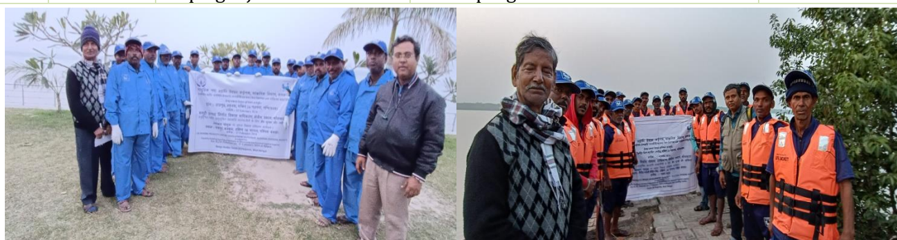
MPEDA Funded awareness program for SC fishers