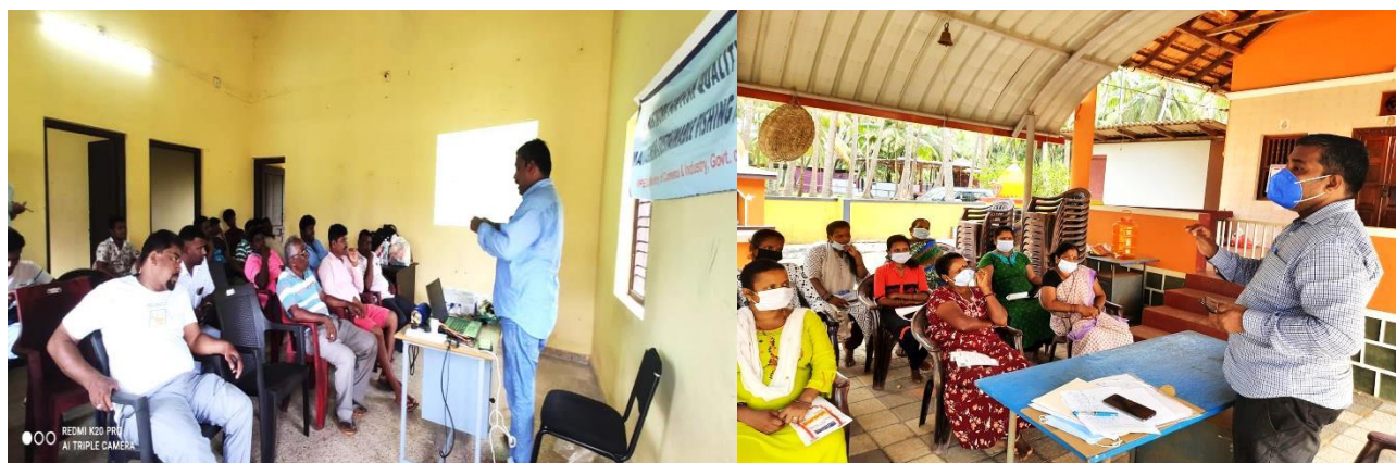
Fishing Harbour based program at Tadri & Malpe