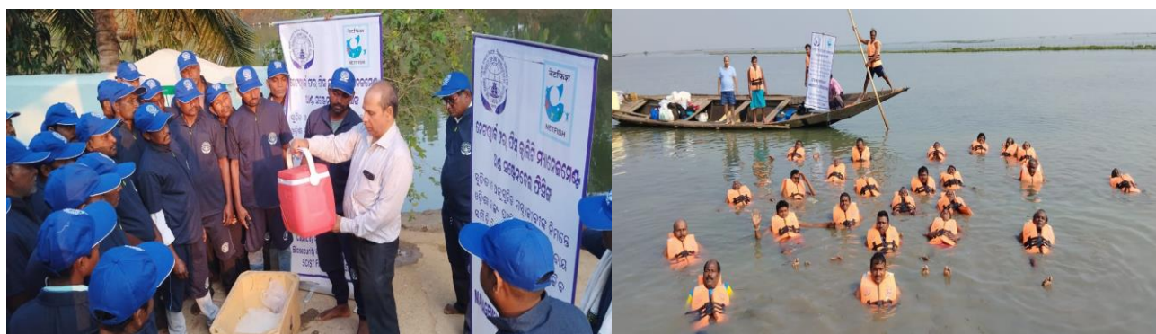
MPEDA Funded awareness program for SC fishers at Chilka