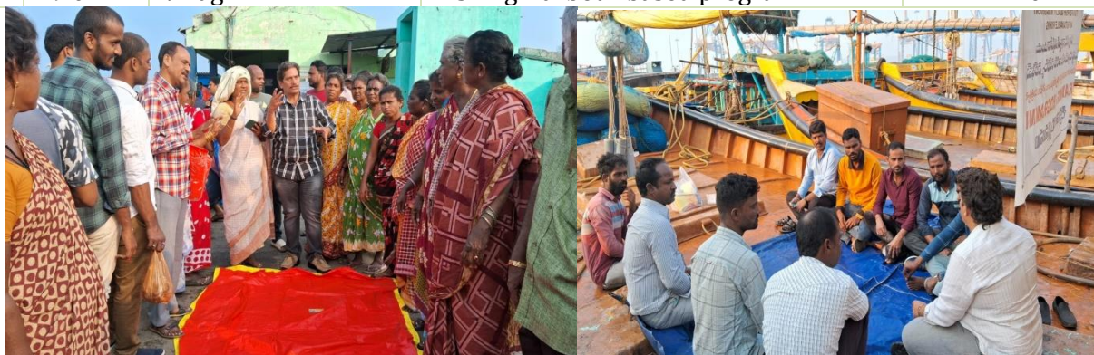
Harbour based training program at Vizag FH