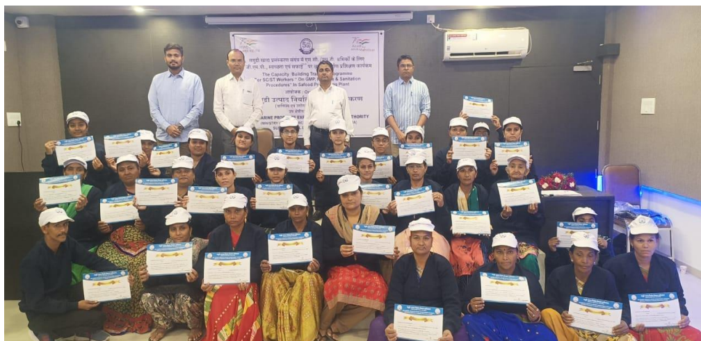
RD MPEDA SC-Seafood Processing plant training program