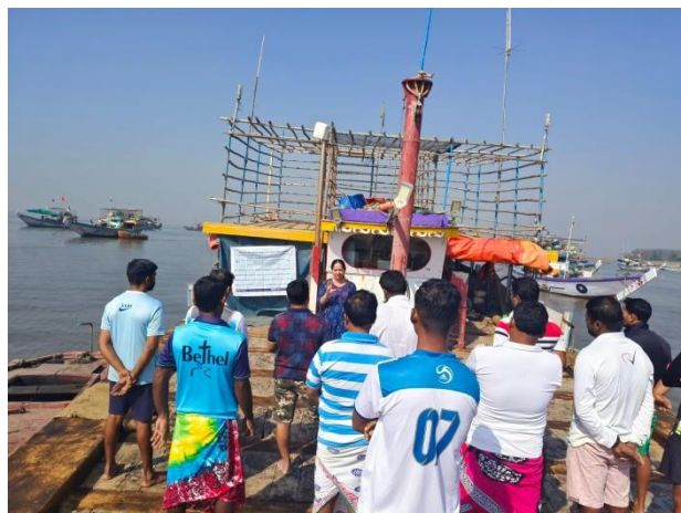
Fishing Harbour based program at New Ferry Wharf & Vasai