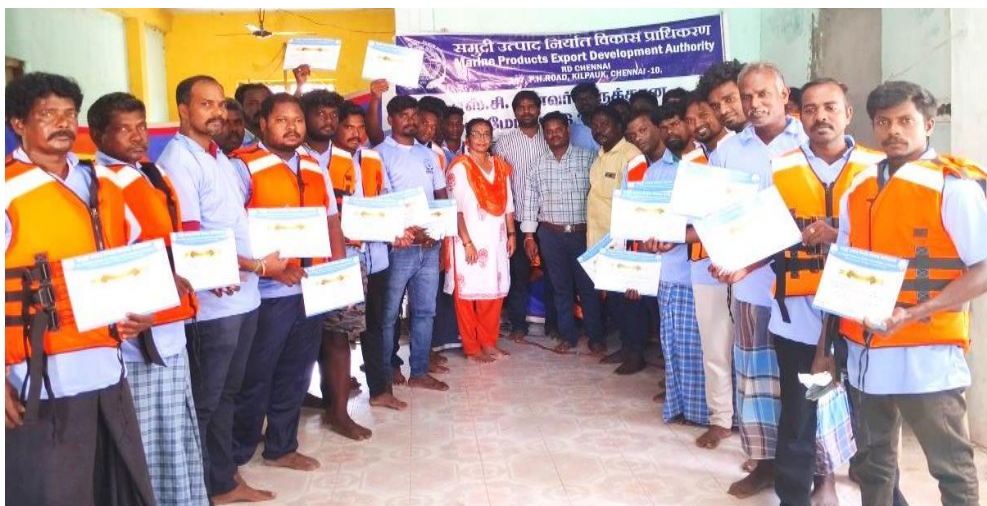
RD MPEDA SC Fund-Fishing Harbour based program