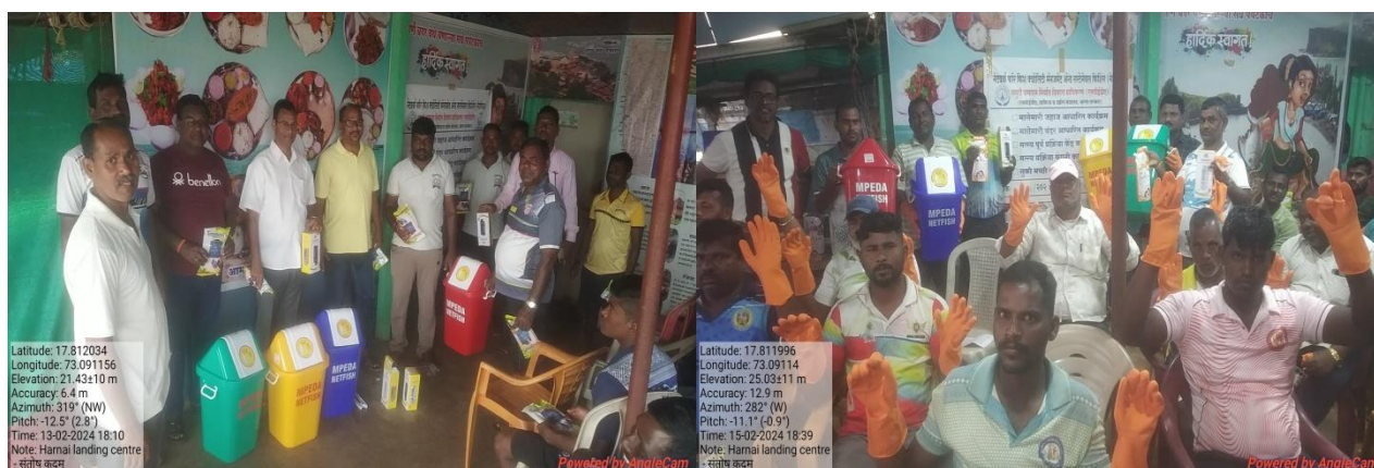
Fishing Harbour based program at Harne