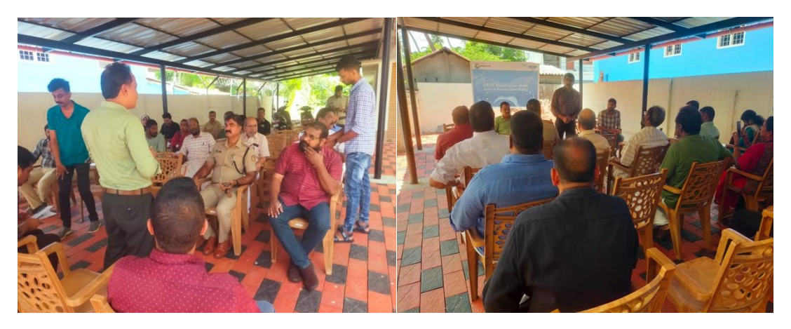
Stakeholders meetings regarding plastic project