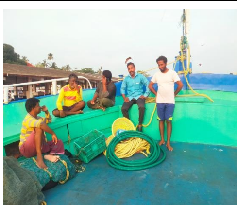
Awareness by HDCs