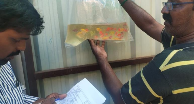
Attending Pondicherry Fisheries Dept. program