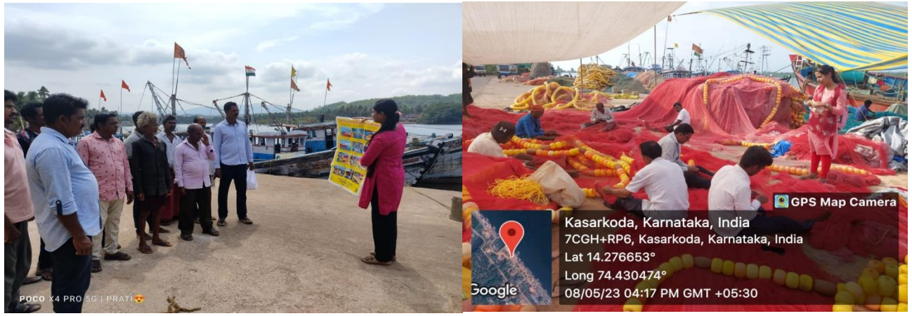
Awareness programs conducted by HDCs