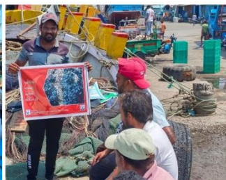
Awareness conducted by HDCs