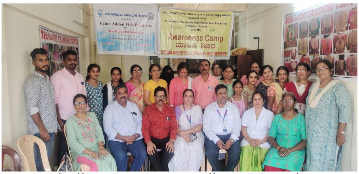
Value addition training programme sponsored by DRP, PMFME, Mangalore