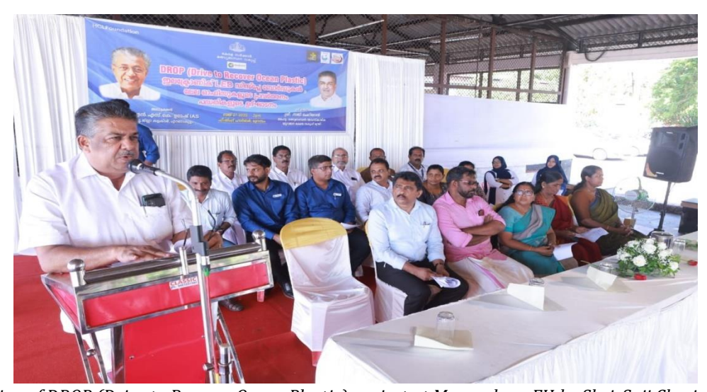
Inauguration of DROP (Drive to Remove Ocean Plastic) project at Munambam FH by Shri. Saji Cheriyan, Hon'ble Minister of Fisheries, Kerala