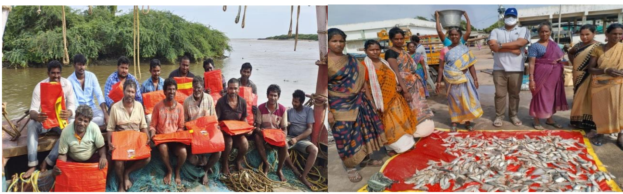
Harbour programme at Nizampatnam