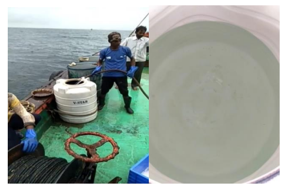
Bringing clean sea water for vessel cleaning