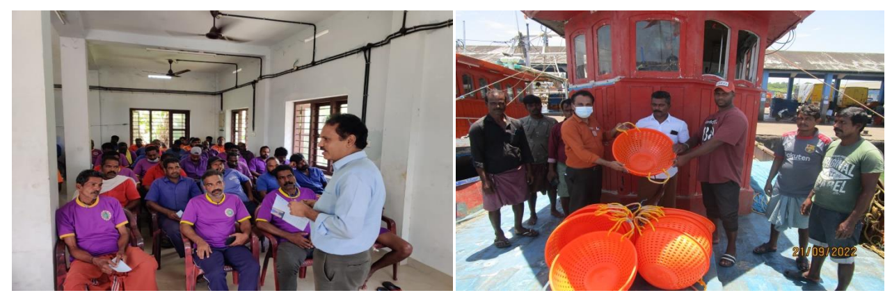
Harbour based programme at Chettuva