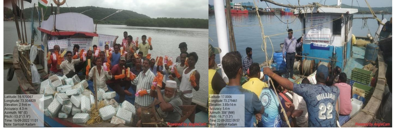
Fishing harbor based programmes at Mirkarwada