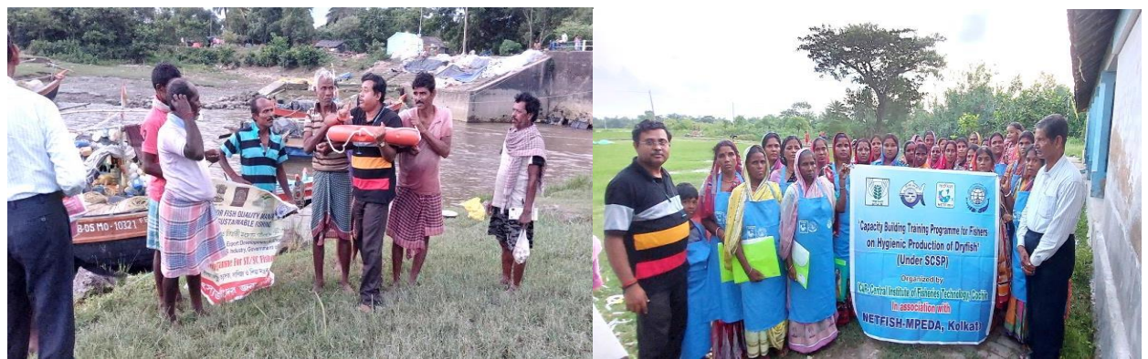
MPEDA funded on-board programme at Mukundapur