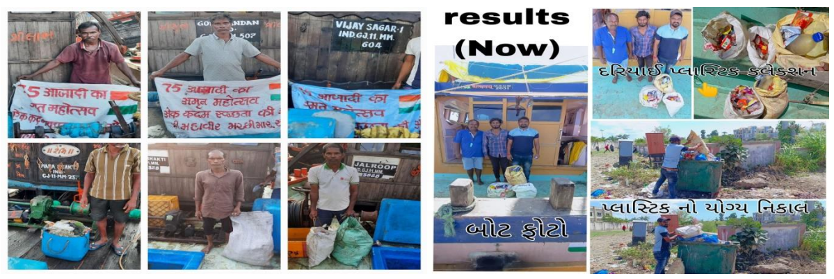
Plastic waste collection from sea