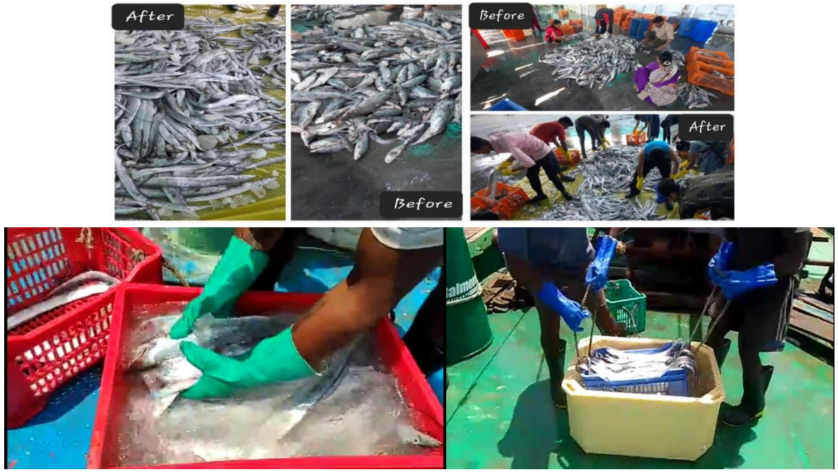
Adopted pre-cooling practices

NETFISH MPEDA trained fishermen/crews/booth holders adopted good hygienic practice to reduce post-harvest loss at Veraval, Mangrol and Porbandar Fishing harbours.