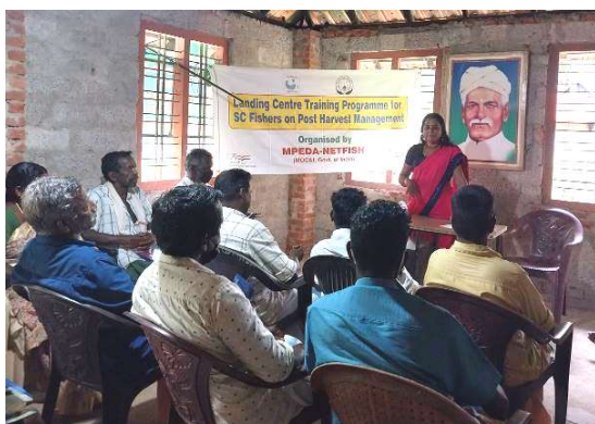
MPEDA SC/ST programme at Thevalakkad