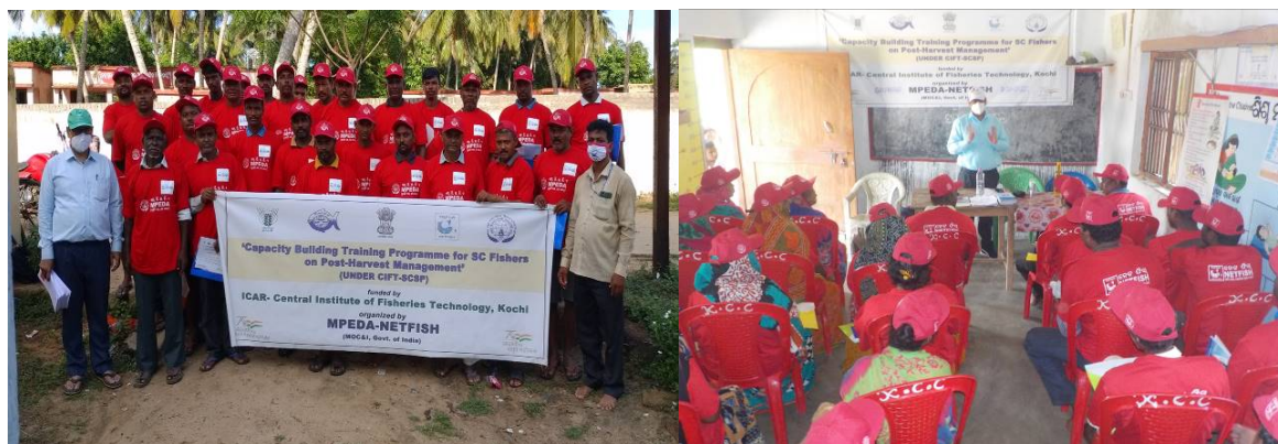
CIFT sponsored awareness programmes at Chilka