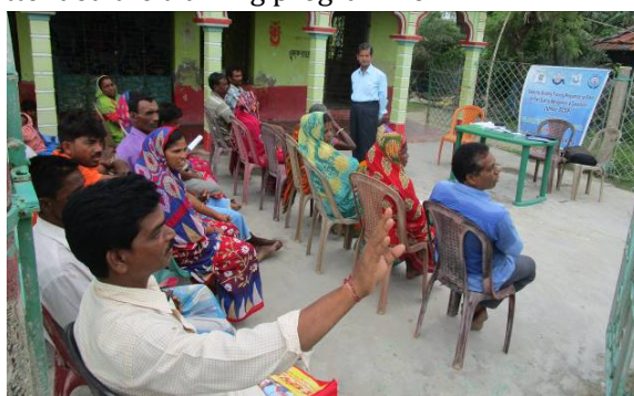
CIFT sponsored awareness programme at Lakhipur

NETFISH, Kolkata had organized a one day training programme at M/s. Rupsha Pvt. Ltd, Kardah, West Bengal to the processing technologists, supervisors, managers and workers regarding COVID-19 guidelines, hygiene & sanitation practices, fish processing technology etc. A total of 34 trainees attended the training programme.