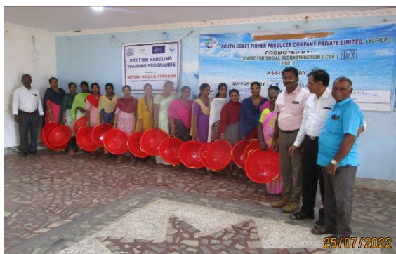
Harbour based programme at Eraviputhenthurai