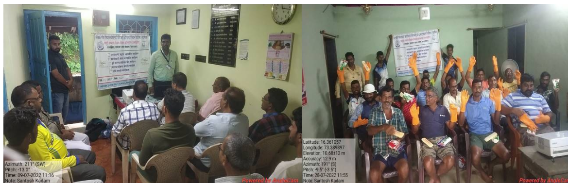
Harbour based programme at Ratnagiri