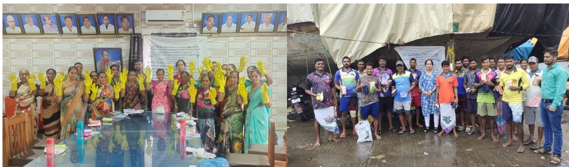
Fishers with Aid materials during awareness programmes