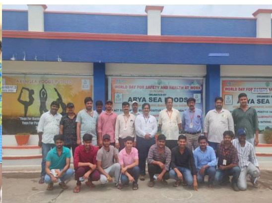
Processing centre programme at Bhimavaram

During the month, the HDCs of AP North coastal region had conducted Marine mammal and sea turtle by-catch survey among 86 fishers in Visakhapatnam harbour (17 boats), Pudimadaka fish landing center (13 boats) and Kakinada fishing harbour (56 boats).