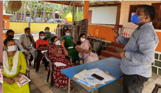
Harbour programme at Gangolli