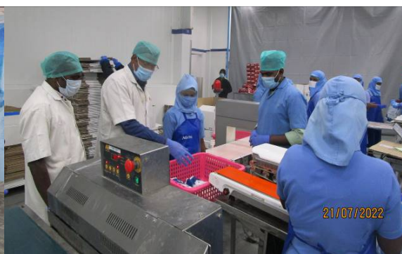
Processing centre programme at Tuticorin