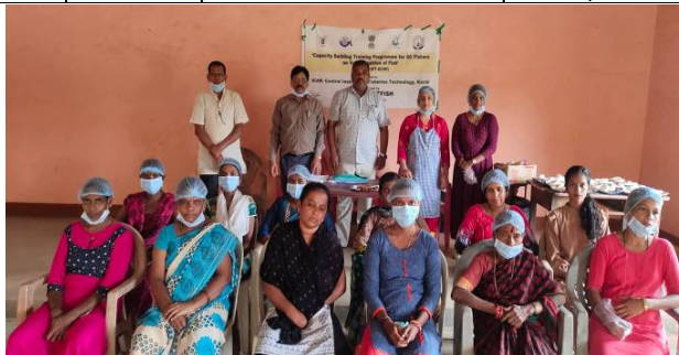
CIFT sponsored Value added training programme