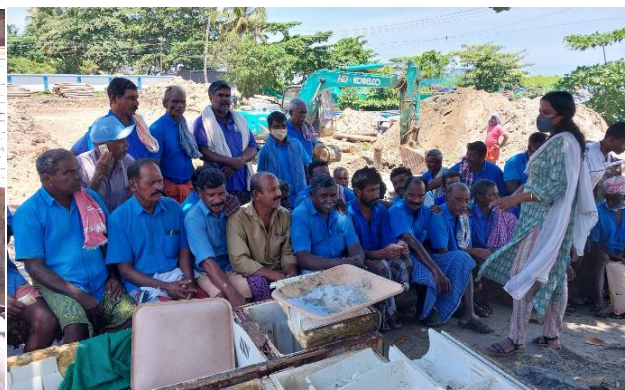
Harbour based programme at Chellanam