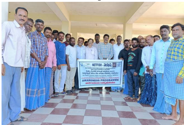
Harbour based programme at Pudimadala

From 27 th to 29 th of the month, SCO had coordinated the visit of CE NETFISH to Andhra Pradesh North region. State Coordinator along with CE NETFISH had visited and interacted with the fishermen and stakeholders of Uppada FLC, Pudimadaka FLC, Kakinada and Visakhapatnam fishing harbours. During the visit, CE NETFISH suggested the fishers to strengthen the existing harbour management committees by generating revenue to meet the expenditures related to the hygiene and sanitation in the fishing harbours.