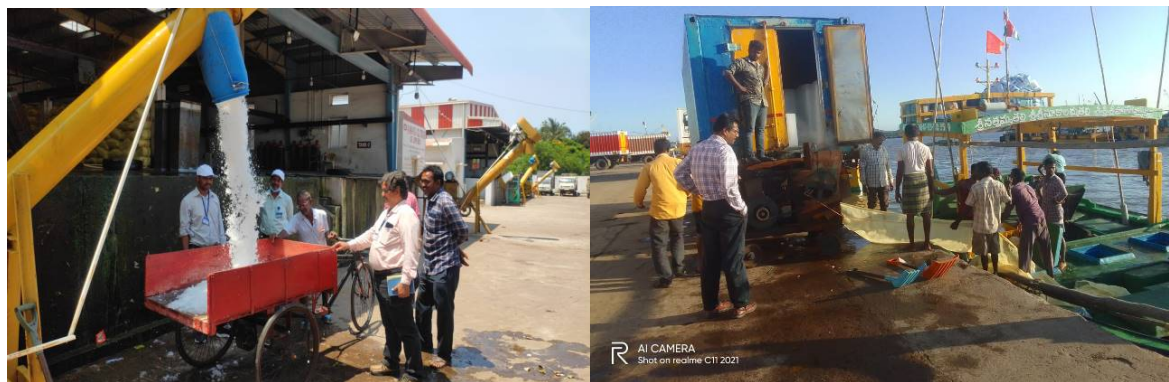
Now-Improved ice handling at Visakhapatnam & Kakinada FH