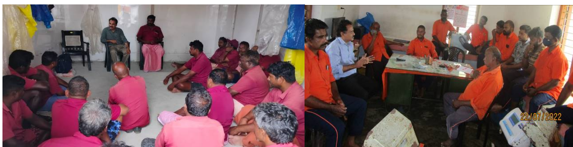
Harbour based programme at Vypin

During the month, SCO had organized two stakeholders meeting, one with an NGO Plan@Earth & Joint Director of fisheries, Ernakulum regarding plastic collection project at Munambam FH. Due to insufficient fund, it was decided to start the project in a small scale in the harbour initially. Another meeting was organized with the stakeholders of Vypin fishing harbour to discuss about the ways to enhance fish handling standards and operational standards of Vypin fishing harbour. SCO suggested to have a dress code for the fish handlers in the harbour and also urged the auctioneers to stop the practice of dumping of fish on floor and to use plastic baskets during auction. The stakeholders agreed to have a dress code for the fish handlers and assured that efforts will be made to keep fish in plastic baskets for the auction purpose.