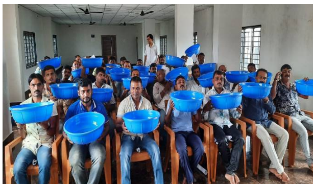
Harbour based programme at Mangrol