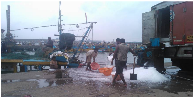
Before-Ice crushing on Jetty

As a result of continuous awareness programmes by NETFISH the ice handling practices at Visakhapatnam & Kakinada are improved. Now ice blocks are not crushed on the floor. The fishermen made a tarpaulin attached to the ice crusher and loading the ice directly in to the fish hold of fishing vessel at Kakinada fishing harbour.