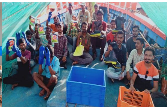
Harbour based programme at Veraval

NETFISH MPEDA in association with Mahavir Fisheries Cooperative Society Mangrol had conducted a special appreciation programme for the captains of fishing vessels who bring back plastic/solid waste from sea to the land for safe disposal. President of the Community, Ex. Authority member of MPEDA and Around 100 fishing vessel captains were attended the programme. SCO briefed about the importance of plastic waste management and the efforts taken by SCO, HDC, and president of Society to implement the plastic waste collection programme successfully in the harbor. More than 100 fishing vessel captains who followed the practice of collecting plastic/solid waste from sea were honored with appreciation letter and memento.