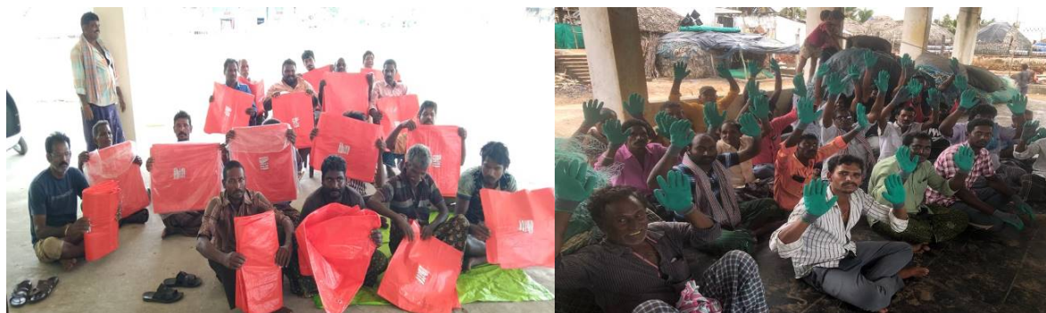
Fishermen distributed with aid materials during awareness programmes