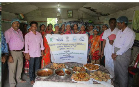
CIFT Value addition programme at Akshaynagar