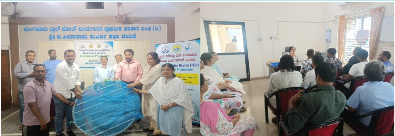
TED distribution and installation program