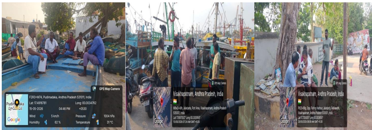
Awareness by HDCs