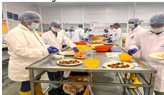
SCO participating in State level Seafood Skill Olympiad