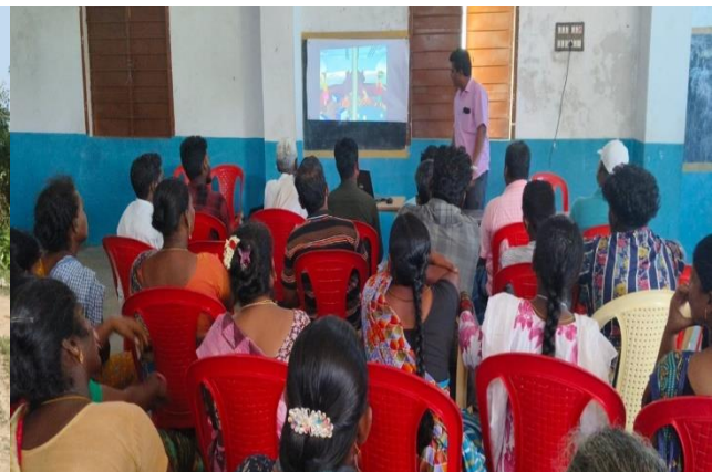
Capacity Building Training Programme for SC/ST fishers