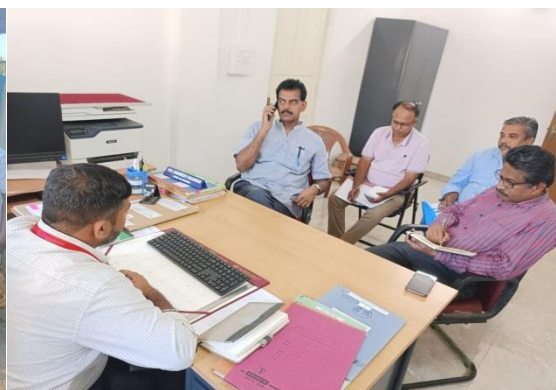
SCO coordinated the visit of JD MPEDA & CE NETFISH to Goa Fisheries Dept.