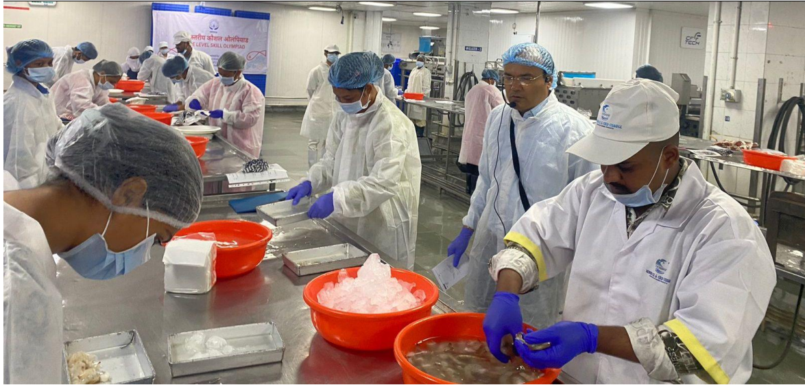
SCO Coordinating the State Level Skill Olympiad