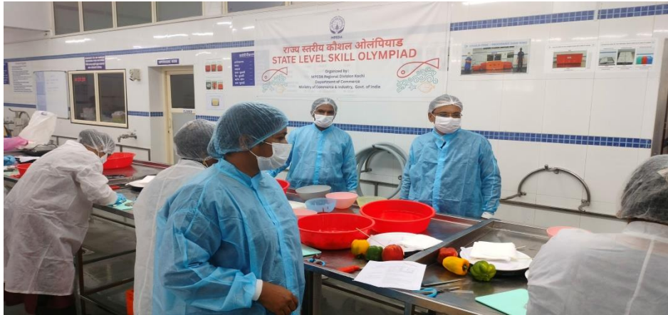
SCO evaluating product preparation during state level skill Olympiad