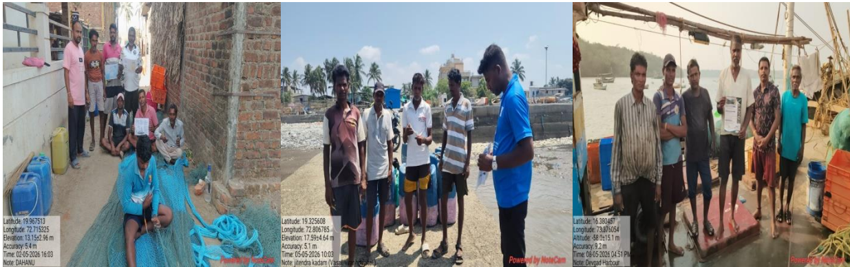
Awareness by HDCs