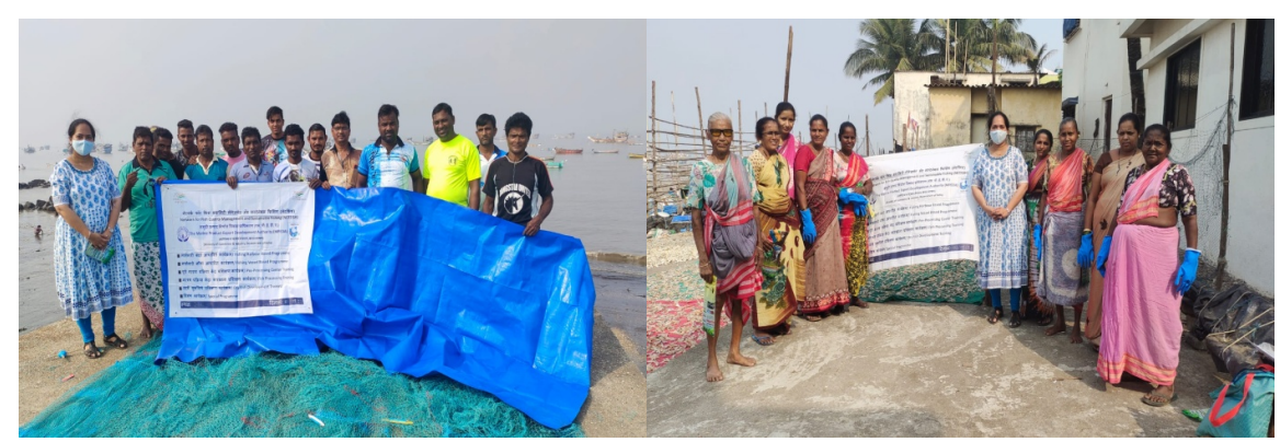
Plastic sheet distributed during FV programme