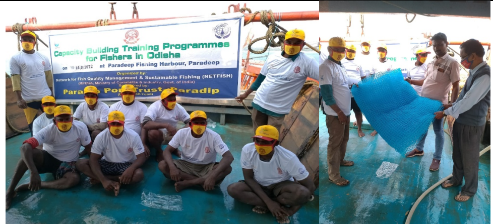
Awareness programme at Pradeep FH-Distribution of Square mesh cod end