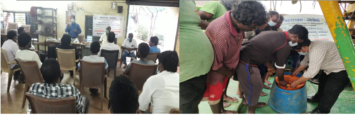
Fishing Harbour based programme at Vizag