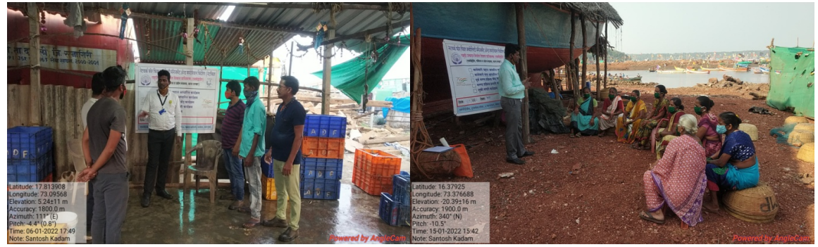
Fishing Harbour based programme at Harne