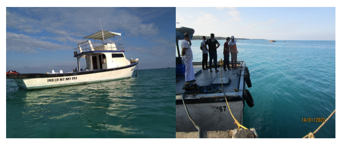
Visiting the fishing vessels to check it suitability for the training programme