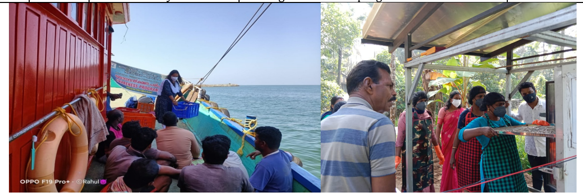
Fishing Vessel programme at Sakthikulangara