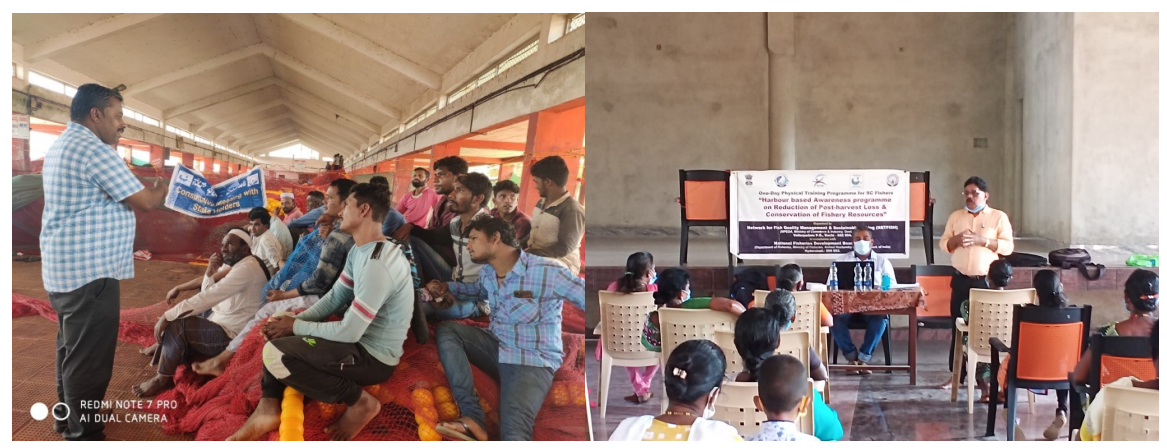
Harbour based programme at Amdalli