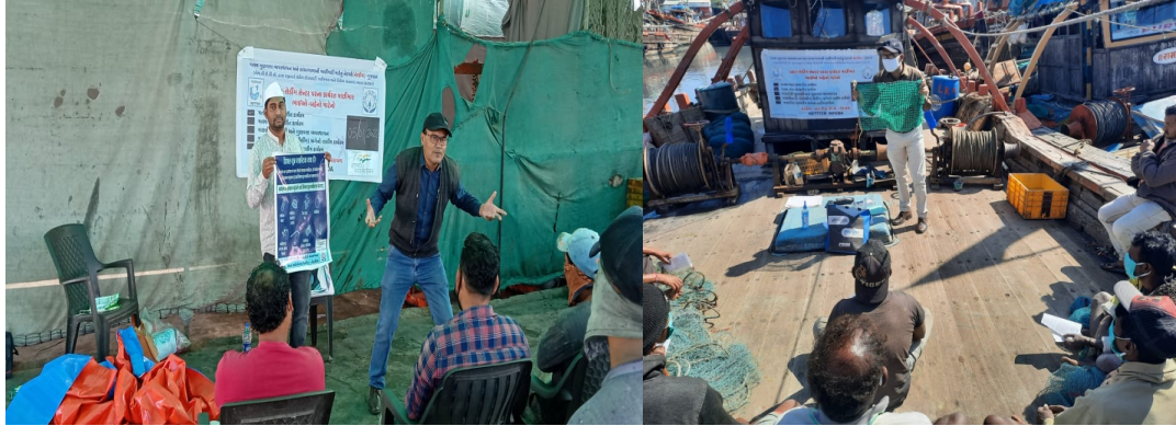
Fishing Harbour based programme at Veraval