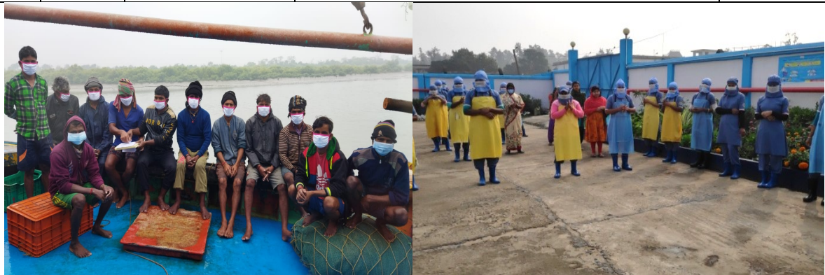
Vessel based programme at Sankarpur