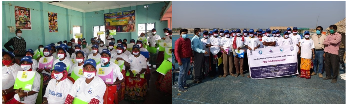
NFDB Sponsored awareness programme at Amarabati & Lalganj