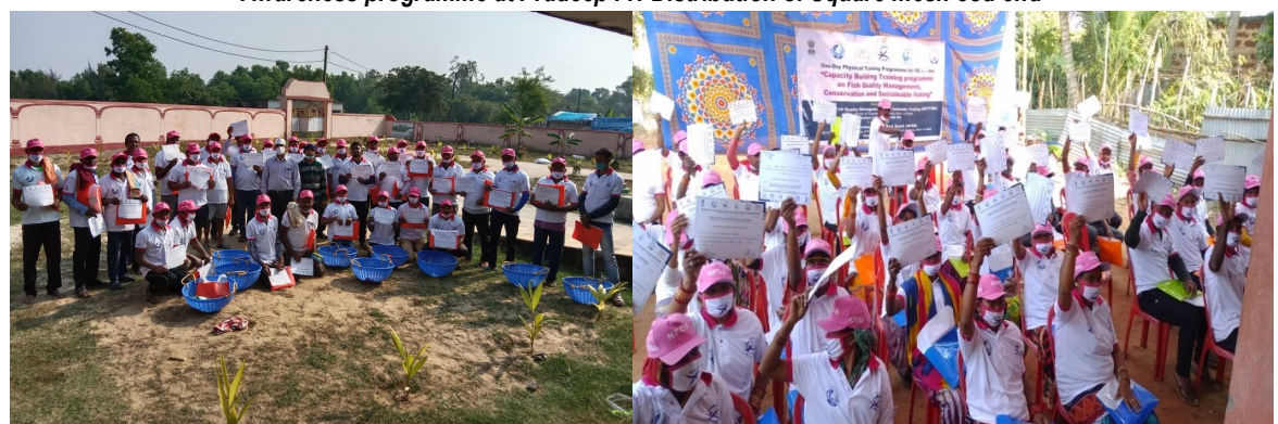
NFDB Sponsored awareness programme at Chilka