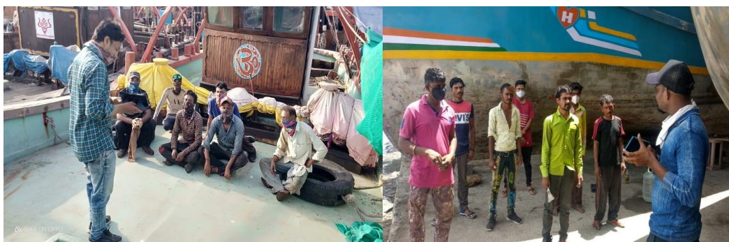
HDCs conducting awareness programmes to fishermen