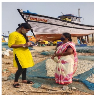
Dry fish survey at Bhatkal