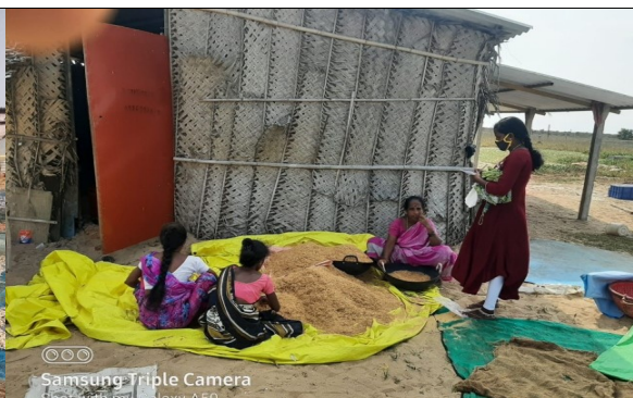
Dry fish survey at Gangolli