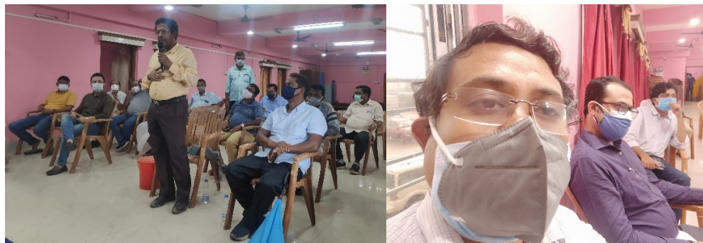
Meeting at Dighamohana, Purba Medinipur on 18 th June 2021