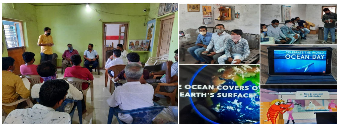
Meeting at Mangrol Meeting at Porbandar