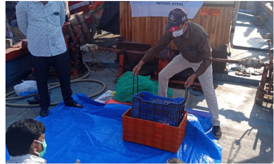
Harbour based programme at Veraval