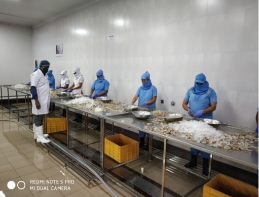
Harbour based programme at Harne