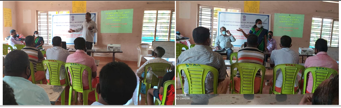
CIFNET-NETFISH joint Awareness programme on Sea Safety at Azheekkal Harbour, Kayamkulam