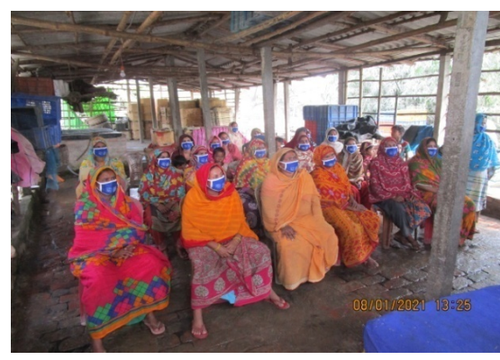
Vessel based programme at Deshapran