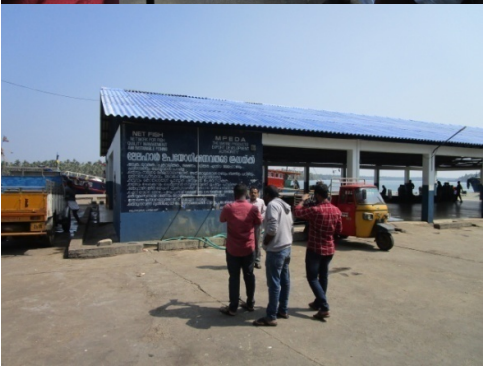
Video Shooting at Munakkakadavu Harbour

➤ Details of information disseminated to stakeholders on social media during the month – (11 WhatsApp groups in 11 harbours)