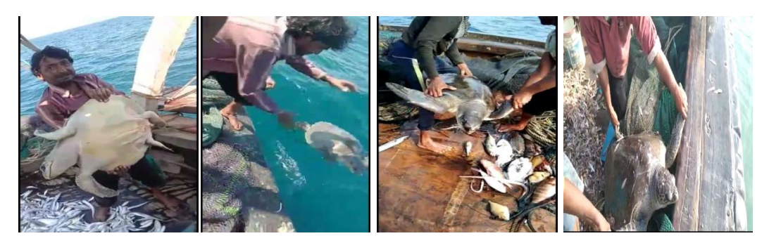
Porbandar fishermen releasing back the Sea Turtles to sea

Innovative/sustainable fishing practice observed during the month : NETFISH Gujarat had given training to HDCs and further HDCs have trained the fishermen about marine mammals and sea turtles, and now the fishermen are releasing protected animals like whale shark, sea turtle etc. which are accidently caught in their net during fishing.