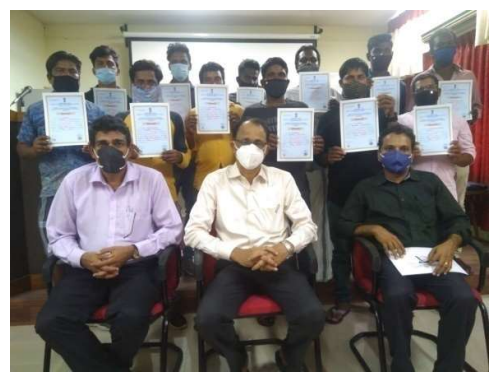
Trainees along with officials