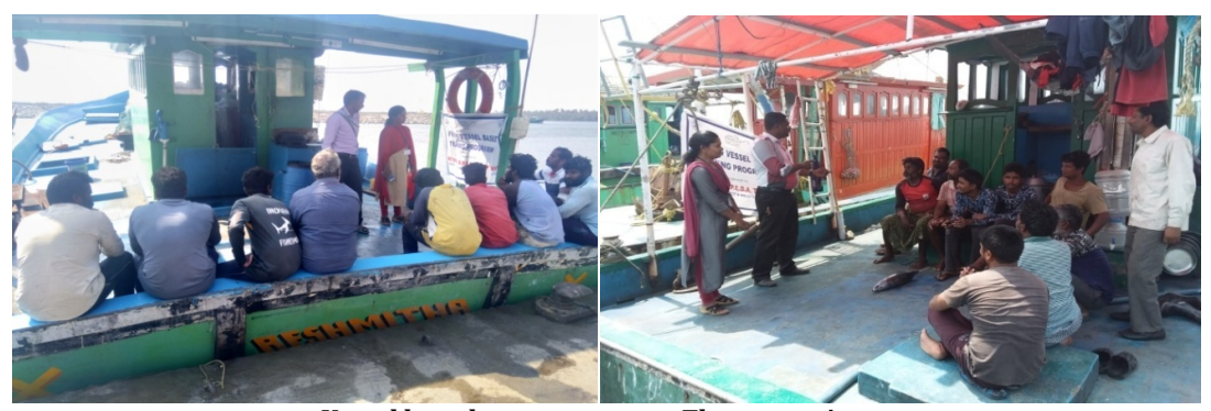
Vessel based programmes at Thengapattinam