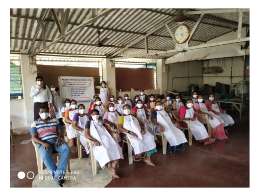
Vessel based programme at Ratnagiri