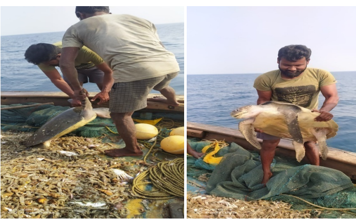
Releasing Sea turtle back to the sea

>> Innovative/sustainable fishing practice observed during the month: