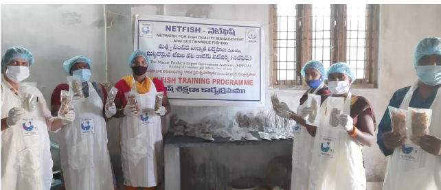
Demonstration programme for packaged dry fish product