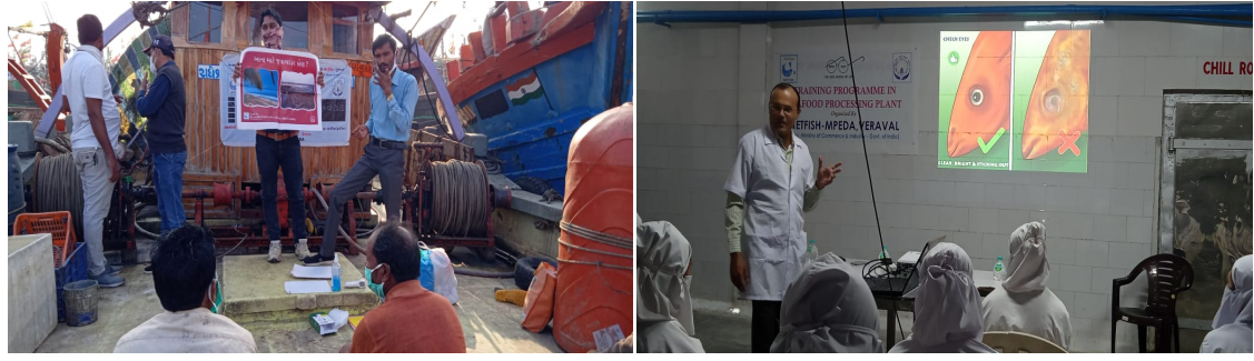
Vessel based programme at Veraval