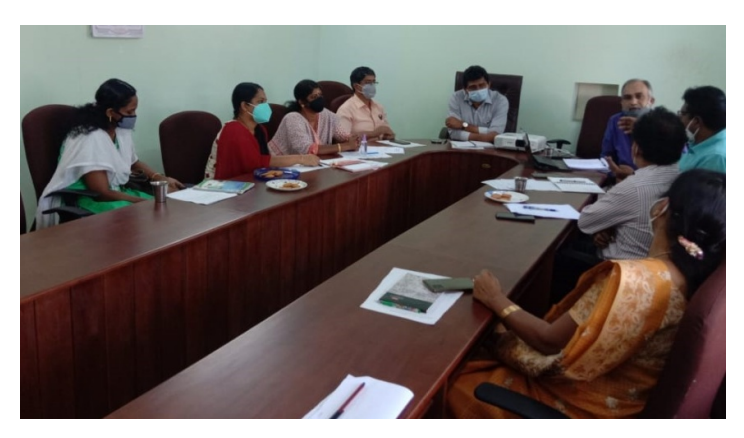
Meeting\ at\ Munambam\ regarding\ feasibility\ study\ for\ e\text{-}\ auction

> Details of information disseminated to stakeholders on social media during the month - (11 WhatsApp groups in 11 harbours)