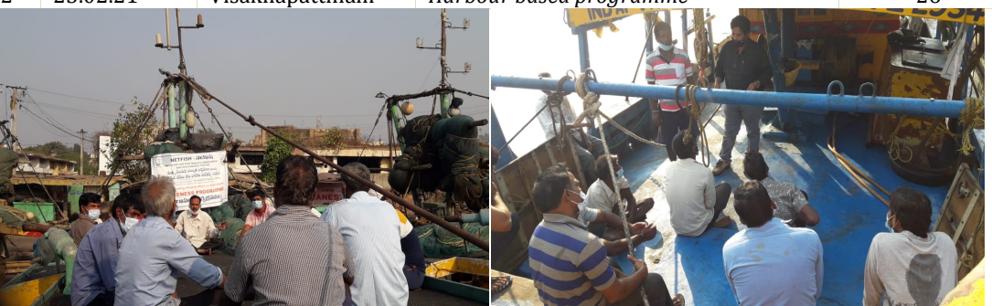
Vessel based programmes at Visakhapattinam

A solar dryer unit with electrical backup was constructed at Vizag harbour with the fund of Visakhapattinam Port trust. The trial run of the facility was organized by the VPT on 5<sup>th</sup> March 2021 to know the performance of the new dry fish unit and to educate the dry fishers. NETFISH had coordinated the programme by identifying the dry fisher's group for the usage of the facility. During the programme, the State Coordinator explained the importance of fish drying in controlled unit and the quality of the product. The procedure for operating the unit was explained by the company personnel and thereafter the drying demo was conducted. It was noted that around 100 kg per 3 hours can be dried using the facility and the beneficiaries were satisfied by seeing the product quality.