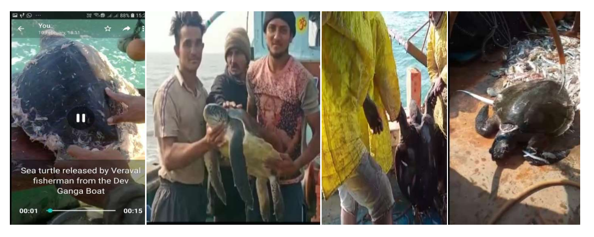
Gujarat fishermen releasing back the Sea Turtles to sea

Innovative/sustainable fishing practice observed during the month : NETFISH Gujarat had given training to HDCs and further HDCs have trained the fishermen about marine mammals and sea turtles, and now the fishermen are releasing protected animals like whale shark, sea turtle etc. which are accidently caught in their net during fishing.