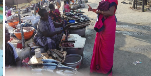
Vessel based programme at Thoppumpady