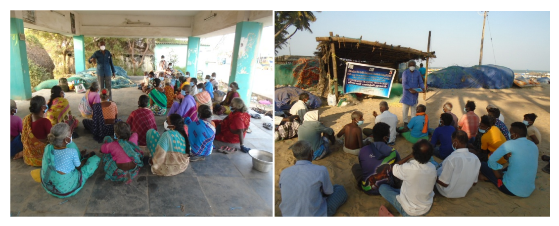
Extension programmes at Cuddalore

➤ Details of information disseminated to stakeholders on social media during the month - (37 groups in 10 harbours)