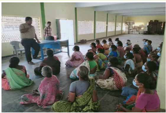
Vessel based programme at Nizampatnam