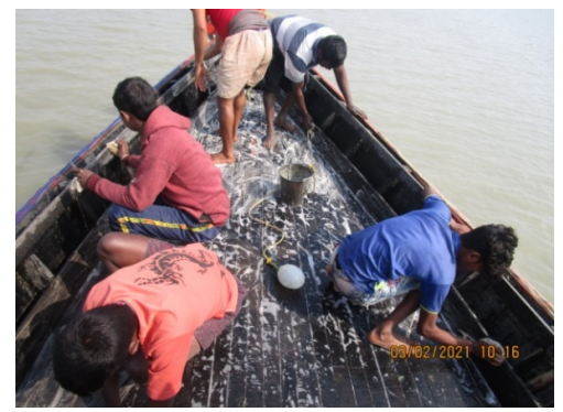
Harbour based programme at Freserganj