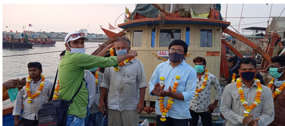
Appreciation programme for owner, captain & crew of fishing vessel 'Jalsagar' who adopted chill killing method in their vessel to reduce post harvest loss.