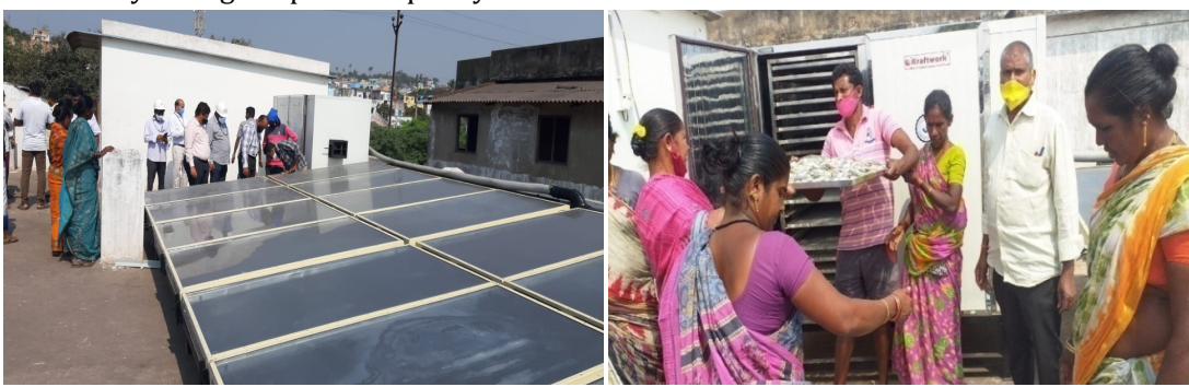
Trial run of the Solar Dry fish unit at Visakhapatnam

A solar dryer unit with electrical backup was constructed at Vizag harbour with the fund of Visakhapattinam Port trust. The trial run of the facility was organized by the VPT on 5<sup>th</sup> March 2021 to know the performance of the new dry fish unit and to educate the dry fishers. NETFISH had coordinated the programme by identifying the dry fisher's group for the usage of the facility. During the programme, the State Coordinator explained the importance of fish drying in controlled unit and the quality of the product. The procedure for operating the unit was explained by the company personnel and thereafter the drying demo was conducted. It was noted that around 100 kg per 3 hours can be dried using the facility and the beneficiaries were satisfied by seeing the product quality.