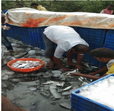
Use of polysheet for sorting of fish