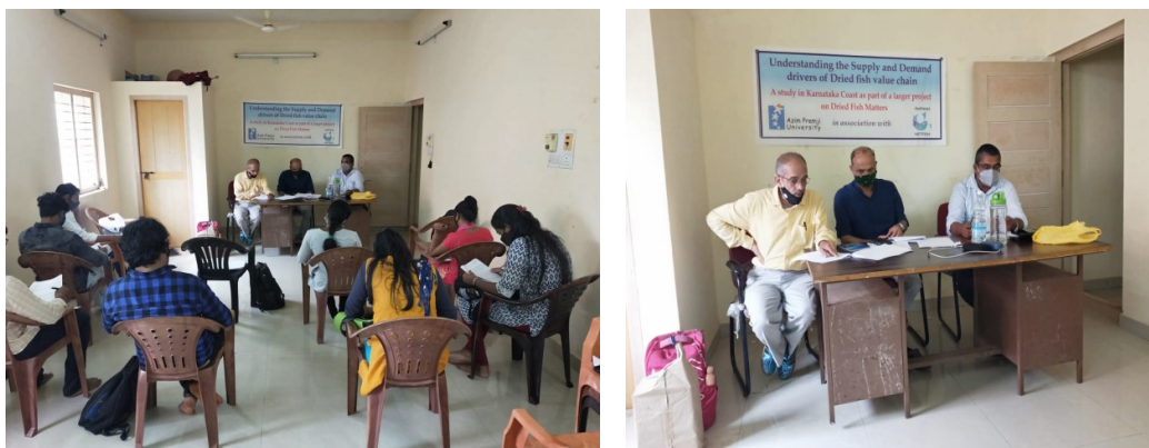
Training programme to HDCs in connection with Dry fish survey