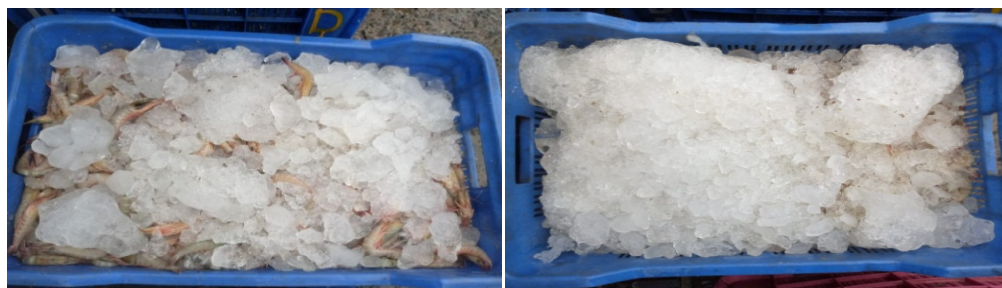
Shrimps preserved with adequate ice in net baskets