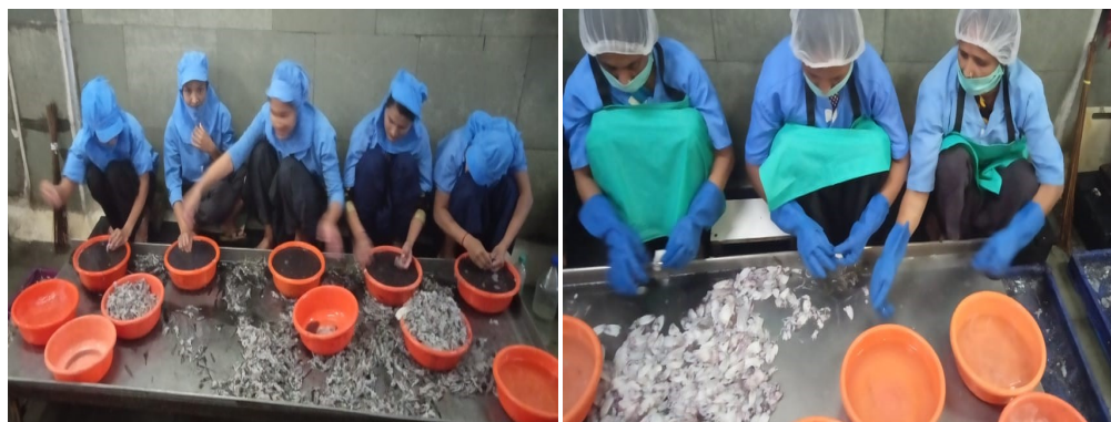
Before Training programme