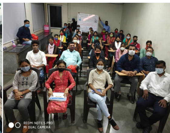
Processing Training at Navasari