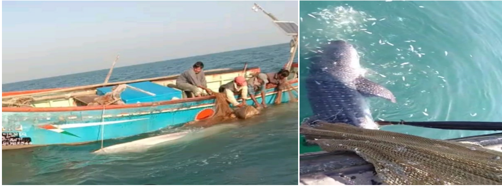
Whale shark released by Fishers of Mangrol & Porbandar