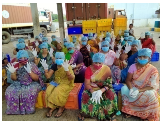
PPC programme at Nizampatnam