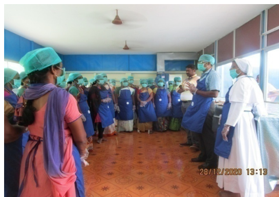
Training on dryfish handling at Kanyakumari

➤ Other works and activities performed during the month are briefed below.