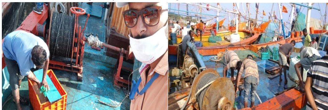
Fishermen cleaning fishing vessel