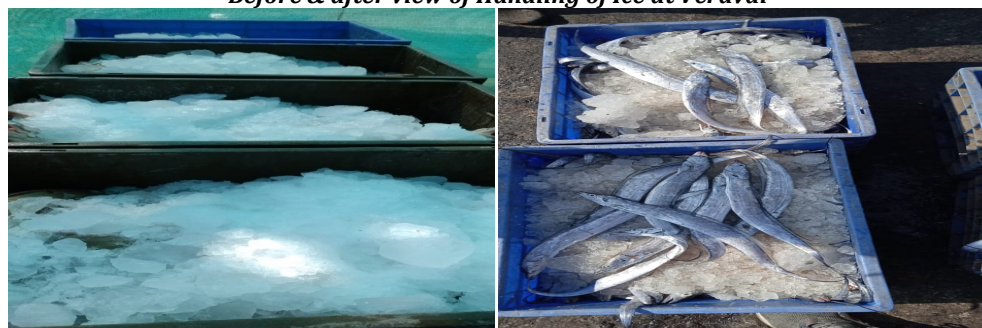
Use of Sufficient quantity of ice to reduce post harvest loss