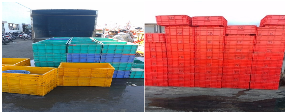
Clean crates and boxes are used to handle fish at Veraval FH