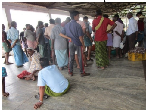
Before- Fish auction on floor