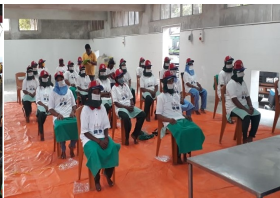
Processing training programme at Paradeep