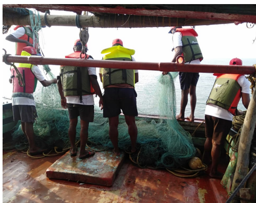
Vessel based programme at Paradeep