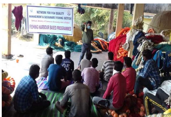
Vessel Based programme at Gangolli