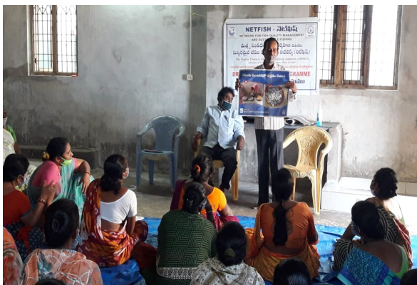
Dry fish programme at Mangamaripeta