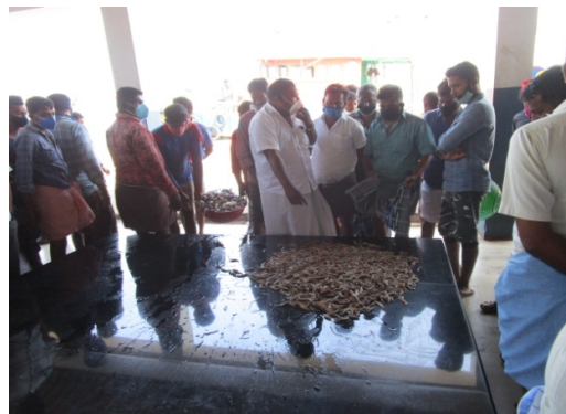
After- Fish auction on raised platform