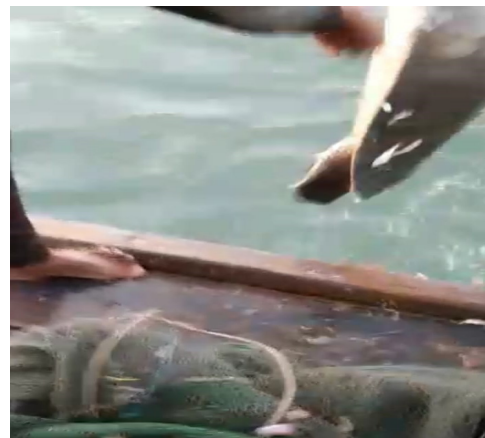
Sea Turtle released by Mangrol Fishermen