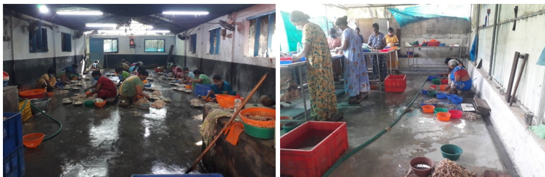
Condition of unorganized PPCs at Ezhupunna