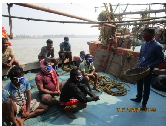
Fishing vessel based programme at Deshapran