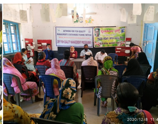
Dry fish programme at Gangolli