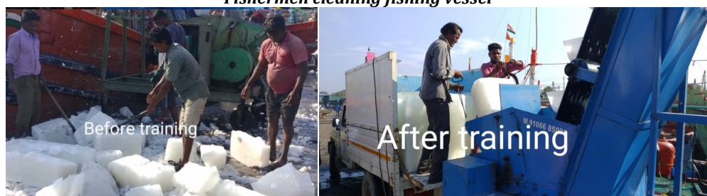
Before & after view of Handling of Ice at Veraval