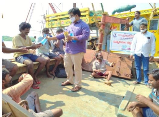
Vessel based programme at Nizampatnam