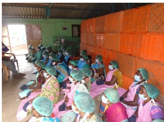
PPC programme at Cuddalore