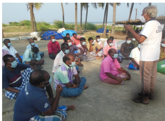
Harbour based programme at Cuddalore

➤ Details of other works and activities performed during the month are briefed below.