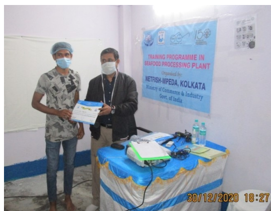
Certificate distribution during Processing unit training