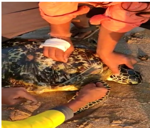
Sea Turtle released by Kotada Fishermen