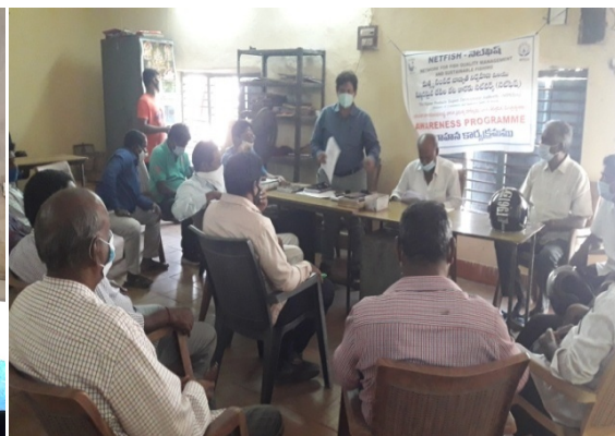
Fishing Vessel based programme at Vizag