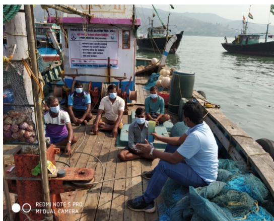
Vessel based programme at Ratnagiri