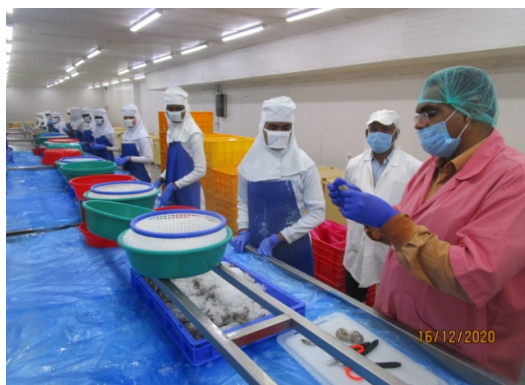
Practical session during the Processing Training at Tuticorin