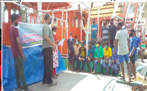
Vessel based programme at Thoppumpady