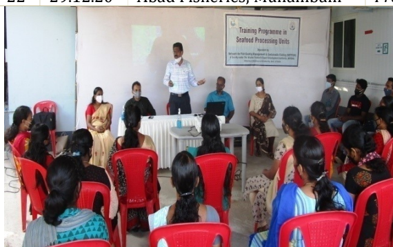
Processing Programme at Abad fisheries, Munambam