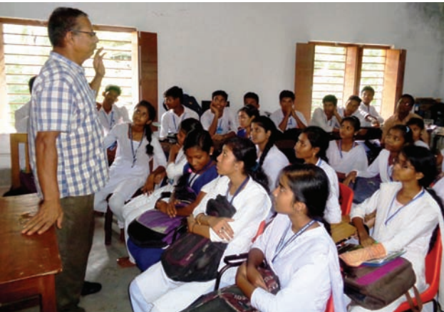
VHSE programme in West Bengal