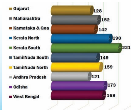
Fig. Total No: of programmes conducted State-wise/ Region-wise

A total of 1603 numbers of extension programmes were conducted by NETFISH during the financial year 2017-18, benefitting around 54338 fishers/fishery stakeholders, as per the details given in Table 3 & 4. Special efforts were taken to popularize square mesh cod-ends among fishers with a view to conserve young ones of fishes from destruction. A good number of hands on training programmes on Value addition of fishery products were also organized during the year especially for the fisherwomen, who can take it as an alternative livelihood. Another major activity to be mentioned during the year was the key role played by NETFISH for the initiation of ‘Suchitwa Sagaram’