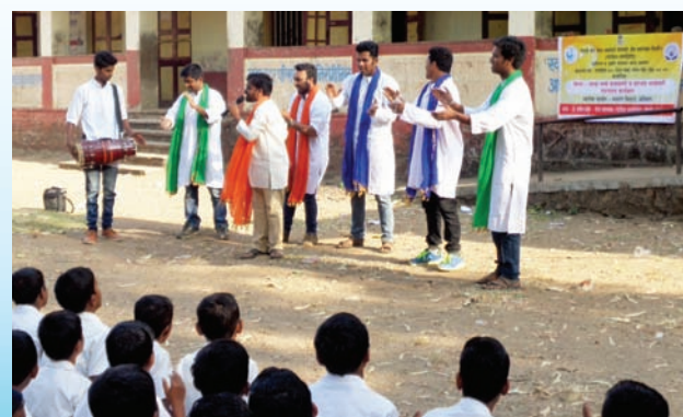
View of street plays organized by NETFISH in Kerala, Tamil Nadu and Maharashtra regions