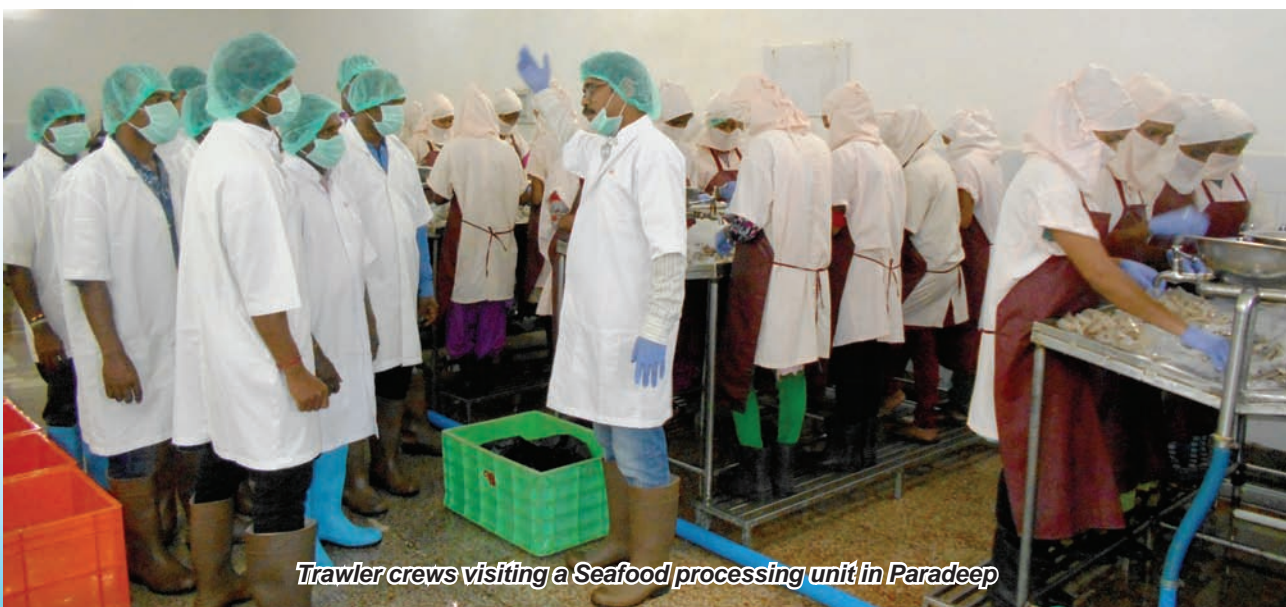
Trawler crews visiting a Seafood processing unit in Paradeep