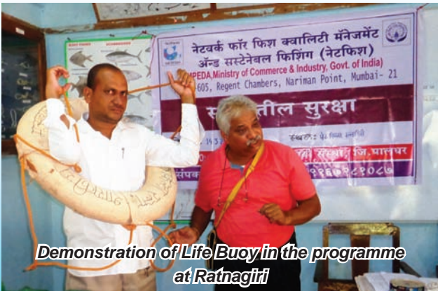
Demonstration of Life Buoy in the programme at Ratnagiri