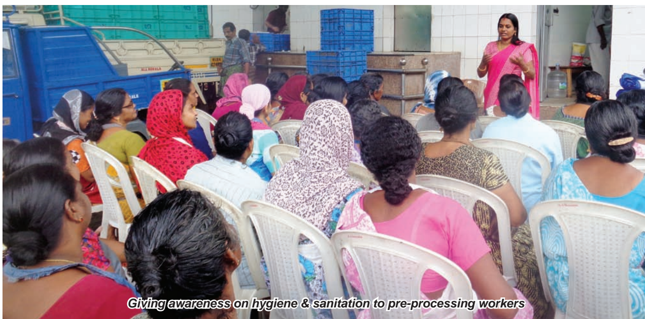
Giving awareness on hygiene & sanitation to pre-processing workers

among the individuals involved in pre-processing centres. Therefore, NETFISH took initiatives to create awareness and train the workers on hygiene & sanitation practices and personal hygiene etc. This year 151 numbers of awareness programmes