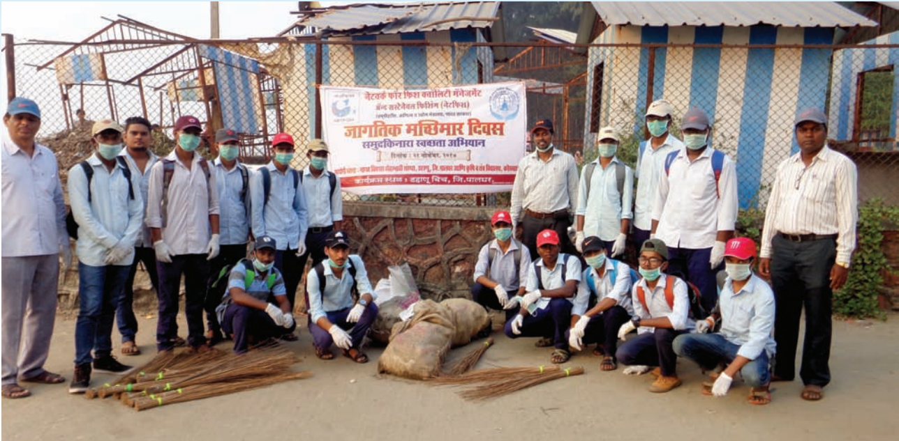
Beach clean-up at Dahanu