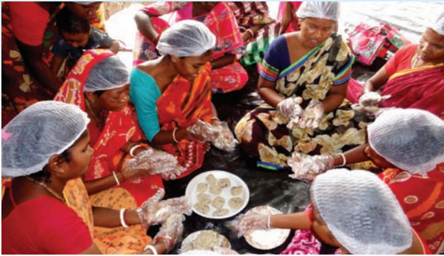
Fisherwomen SHG members in West Bengal engaged in preparation of value added products