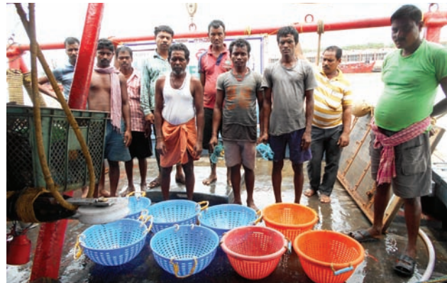
Boat crews with plastic baskets supplied by NETFISH

After attending the training programmes the fishers, skippers and boat owners became well aware about the quality of fish, how & why the fish get spoil and how to prevent it and hence they have started maintaining personal hygiene and proper sanitation conditions in fishing vessels. Thus the fishers are now getting better price for their catch.