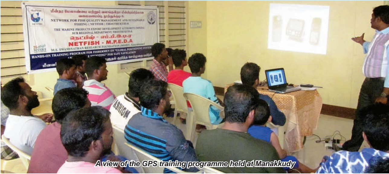
A view of the GPS training programme held at Manakkudy