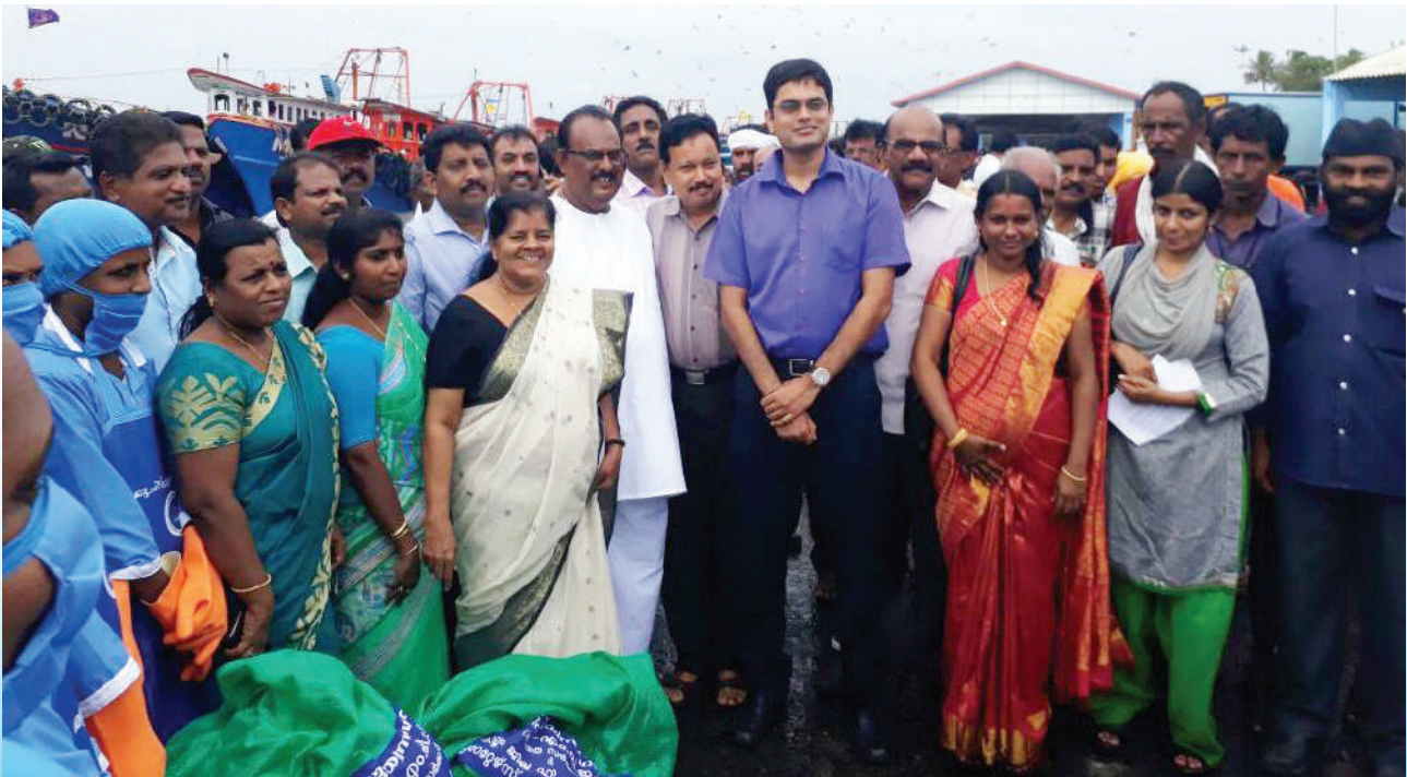
Inauguration of the project by receiving the plastic waste containing bags from the fishers

place in the Neendakara harbour for operating a unit managed by the Suchitwa Mission for segregation of the collected waste for shredding and recycling and the shredding unit was officially inaugurated on 20 th November 2017. This project is run by Department of Fisheries by engaging lady workers from Society for Assistance for Fisherwomen (SAF). A total of 30 workers are involved in this project for collecting the bags from fishing vessels, sorting/ segregation of plastic wastes, washing, drying and shredding. NETFISH provided 2000 eco-friendly sacs for this programme which were supplied at a rate of 2 nos. each to every fishing vessels, to collect the plastic material that come across while fishing at sea. Later on, 2000 more net bags were provided by NETFISH for the project. Awareness stickers were also developed by NETFISH for the project, which were pasted at fishing boats and harbours to provide information to the fishers about the project. Around 30-40 bags each containing about 40-50 Kgs. of plastic wastes are being landed daily at Sakthikulangara harbour. The shredded plastic will be used for suitable activities including road construction and initially HED will utilize the material in the road works they undertake.