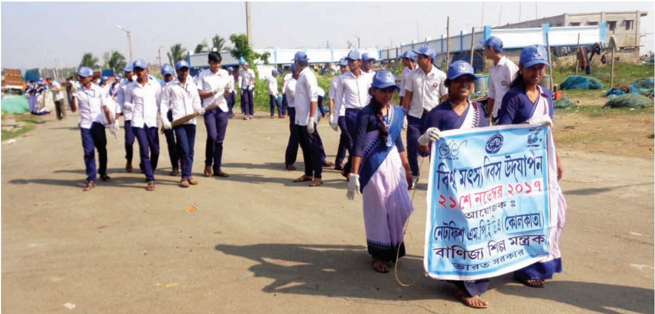
Harbour cleanup at Deshapran with the involvement of VHSE students

In West Bengal a harbour clean-up programme was organized at Deshapran Harbour, with the active participation of VHSE students and teachers of Kishorenagar Siksha Sadan, Contai, Harbour Officials, NGO member, Harbour cleaning staff, fishermen and net menders. General awareness on hygiene in fishing harbour, personal hygiene,