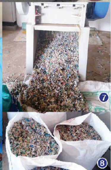
1. Receiving waste containing bags from boats; 2. Workers carrying the bags in trolleys to segregating area; 3. Segregation of wastes; 4. Washing the plastic wastes; 5. Cleaned and dried wastes brought at shredding unit; 6. Loading the plastic wastes into the shredding machine; 7. Shredded plastic product; 8. Stored in sacs for further use