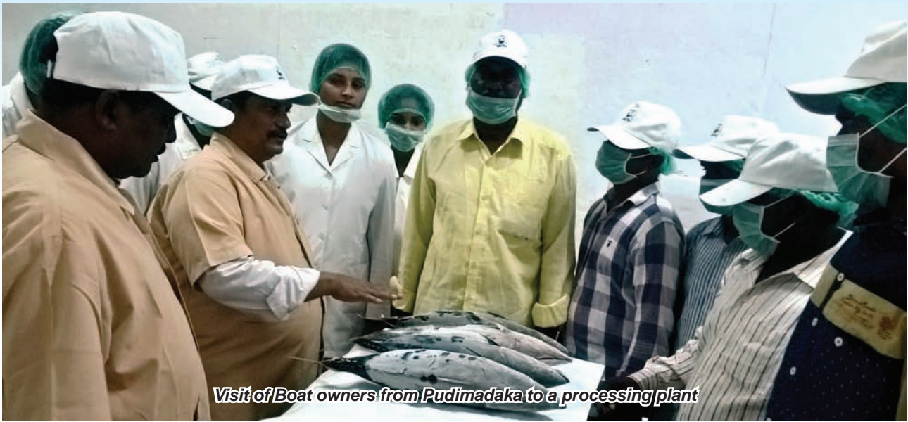
Visit of Boat owners from Pudidmada to a processing plant