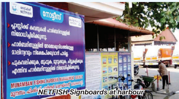
NETFISH Signboards at harbour