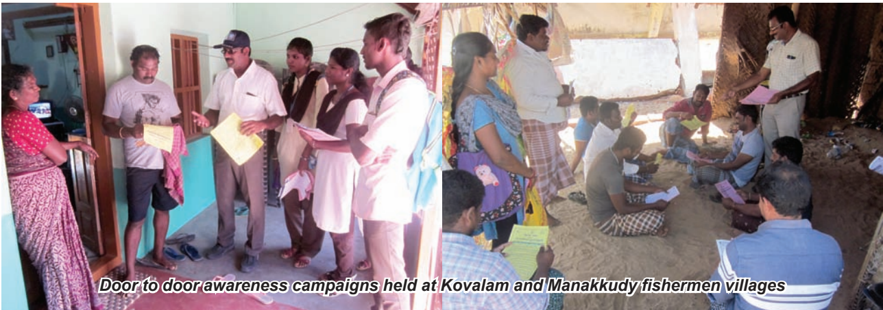
Door to door awareness campaigns held at Kovalam and Manakkudy fishermen villages

An awareness campaign cum stakeholders meeting on Illegal Unreported and Unregulated (IUU) fishing was conducted at Manakkudy in Kanyakumari District on 6 th January 2018. SCO, NETFISH comprehended on how avoiding IUU fishing that will prevent destruction of the fishery stocks and