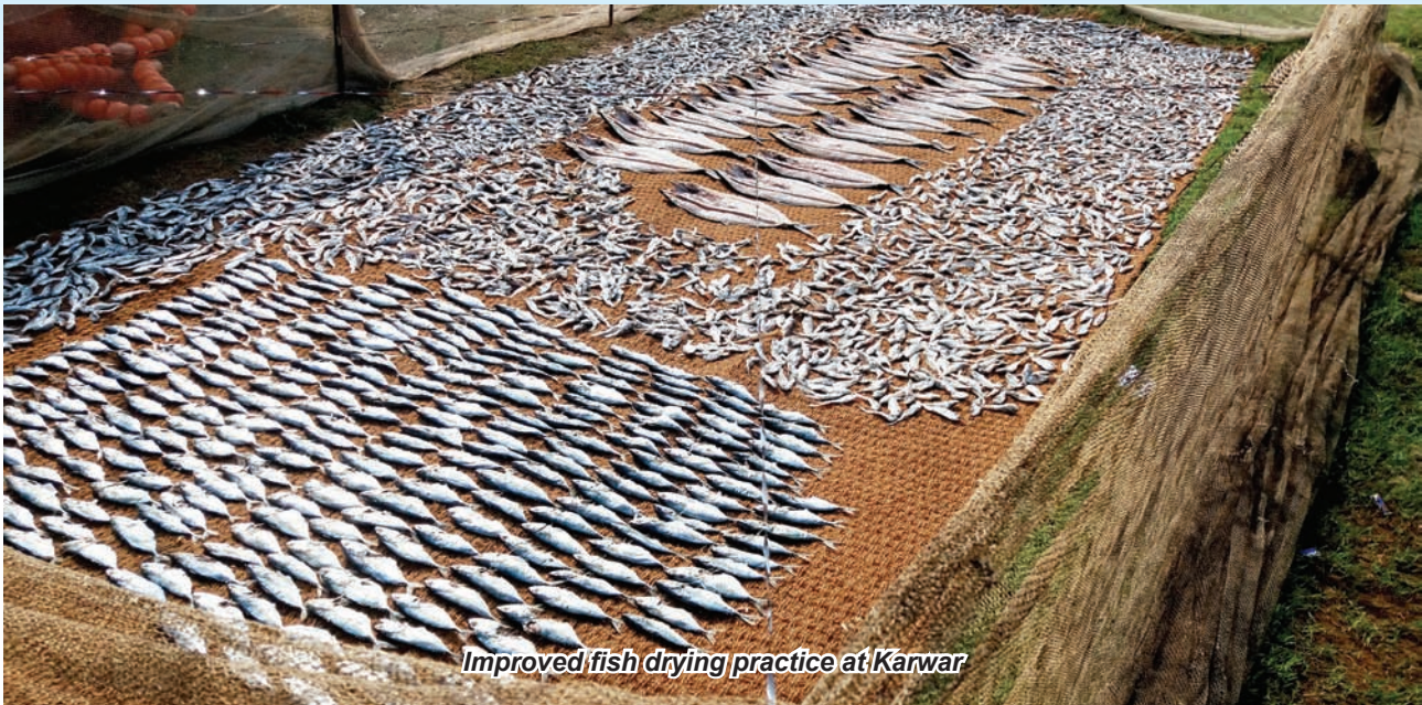
Improved fish drying practice at Karwar