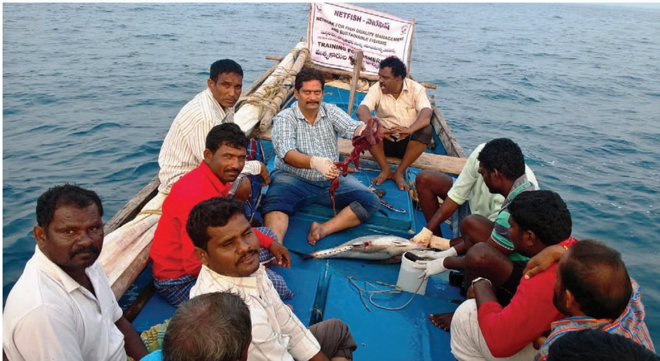
Training for fishers on processing of Tuna onboard