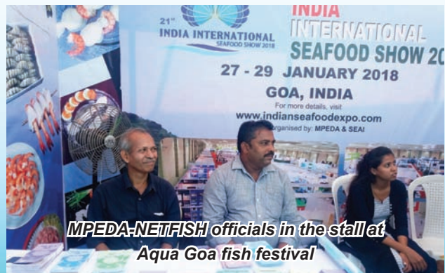
MPEDA-NETFISH officials in the stall at Aqua Goa fish festival