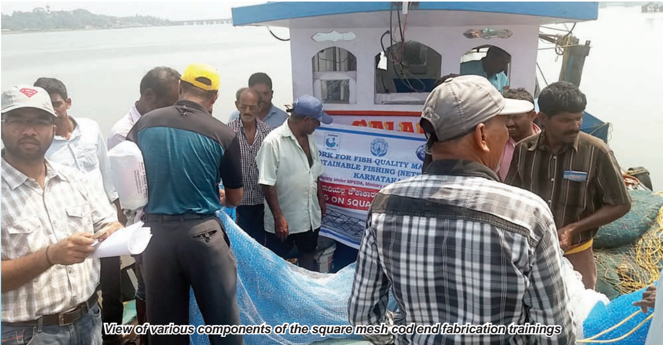
View of various components of the square mesh cod end fabrication trainings