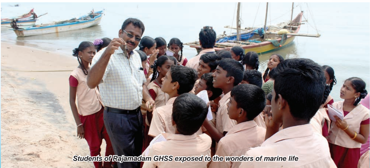
Students of Rajamadam GHSS exposed to the wonders of marine life