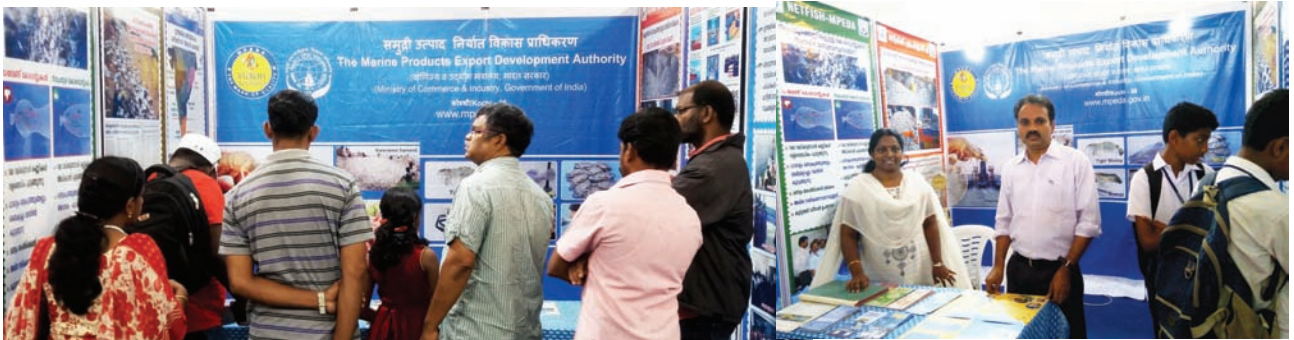
MPEDA - NETFISH stall in SAFARI 2 & Albertian Expo

‘Matsyotsavam’: During the year, the Fisheries Department of Kerala had organized a fish festival named as ‘Matsyotsavam’ along the coastal districts of Kerala. NETFISH was invited for the event where a stall was set up by displaying various posters portraying crucial information and photos on Minimum Legal Size (MLS) in fisheries, fishing ban, impact of juvenile fishing, advantages of square mesh cod ends, decline in fish catch of Kerala, NETFISH and its activities, hygienic handling of fishes etc. Leaflets and brochures containing awareness messages related to fish quality management and sustainable fishing were distributed to the fishermen, fisher women, other stakeholders, fisheries officials, officials from related departments, students as well as general public visited the stall. The event proved a good