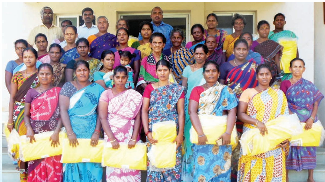
The dryfish workers with plastic sheets provided by NETFISH

A special programme was conducted for the fishermen community living around the MPEDA Vallarpadam project complex on 29/6/2017, aimed to uplift their awareness about hygienic preparation of