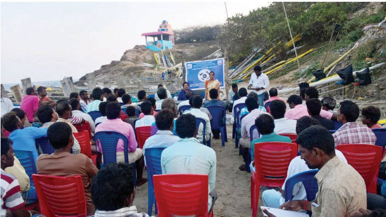
Mass awareness meeting with fishery stakeholders at Pudimadaka