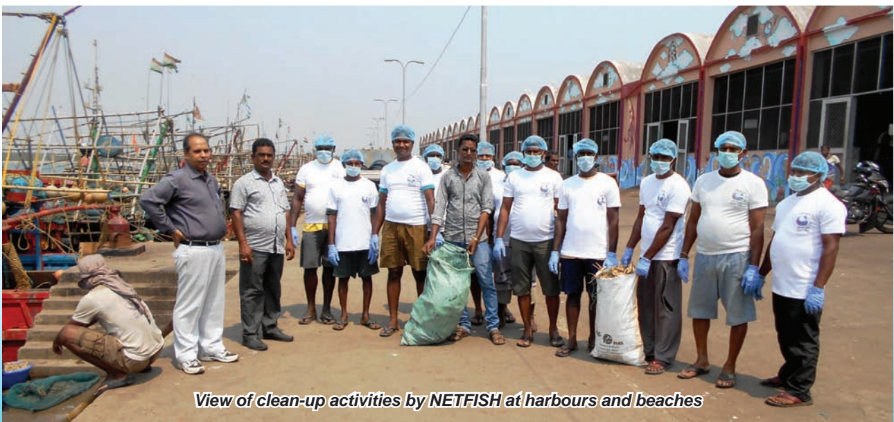
View of clean-up activities by NETFISH at harbours and beaches