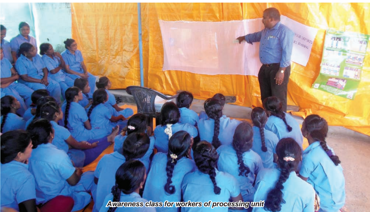
Awareness class for workers of processing unit

During the year 2017-18, a total of 47 awareness programmes were organized at processing units, mostly on demand basis. The targeted beneficiaries were processing workers, supervisors and technologists of processing centers, to whom lectures on sanitation & hygienic practices in the processing centre, HACCP system, hygienic handling of shrimps, physical, chemical & biological hazards, role of ice, fish spoilage and the role of microbes, personal hygiene & habits, uses of change room, and