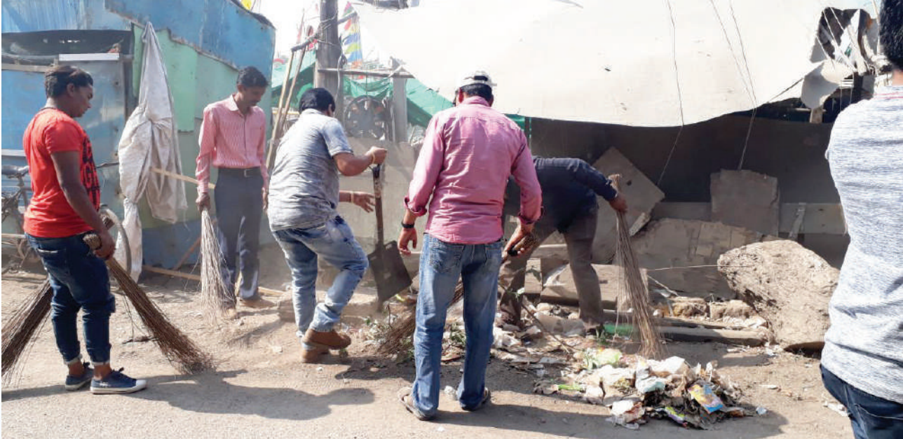
Harbour Clean-up at Porbandar to celebrate World Fisheries Day

A harbour clean-up programme was arranged at Porbandar, in collaboration with Porbandar Machhimar Boat Association, fishermen community of Porbandar and Porbandar Municipal Corporation. Around 200 volunteers joined the clean-up drive which started off from eastern end of the harbour and moved towards western end, whereby removing huge quantity of wastes from the harbour. The leaders of fishermen community urged the temporary both holders to keep clean their own premises and to keep sign boards.