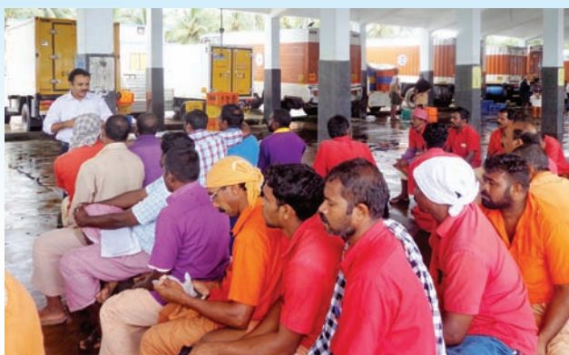
Awareness class at Chettuva harbour