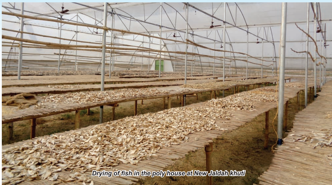
Drying of fish in the poly house at New Jaldah khuti