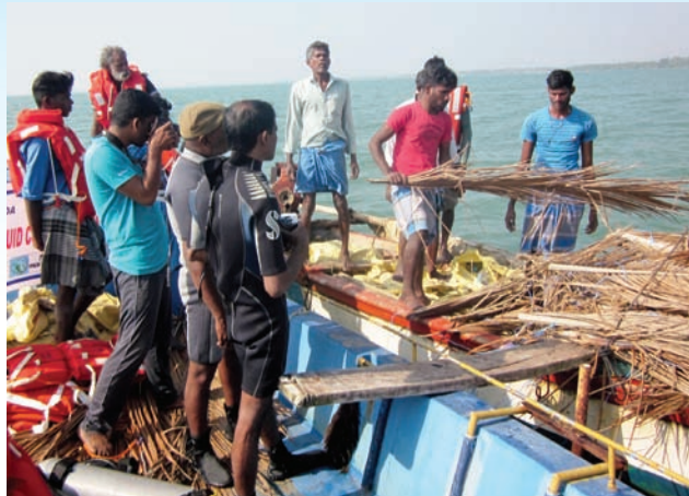
Demonstration of deployment of Fish Aggregating Device