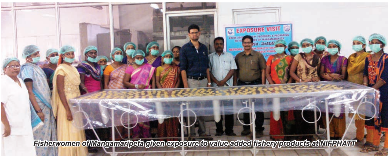
Fisherwomen of Mangamaripeta given exposure to value added fishery products at NIFPHATT

added fishery products like fish powder, pickle, fish wafer, tin fish products, dryfish products etc. and their processing with all hygienic measures. The preparation of Fish wafer was demonstrated and the trainees could involve in packing of Dry fish products.