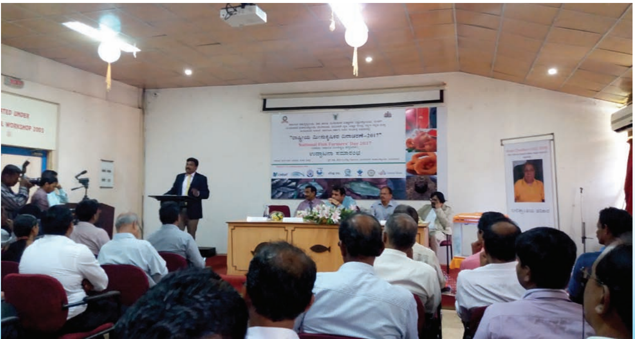
Celebration of National Fish Farmer's day 2017 at Mangalore