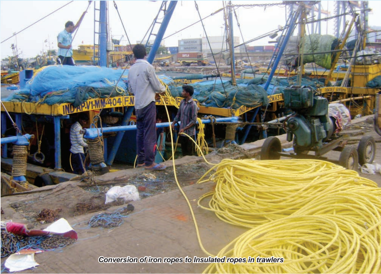
Conversion of iron ropes to Insulated ropes in trawlers