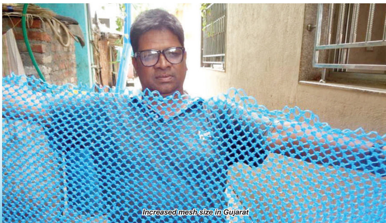
Increased mesh size in Gujarat