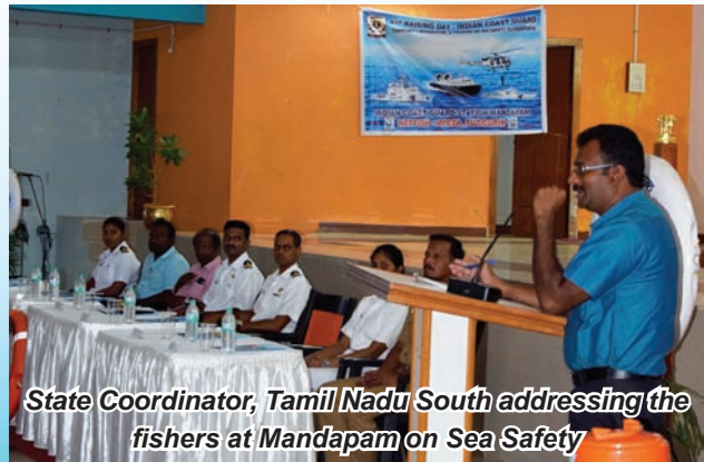
State Coordinator, Tamil Nadu South addressing the fishers at Mandapam on Sea Safety