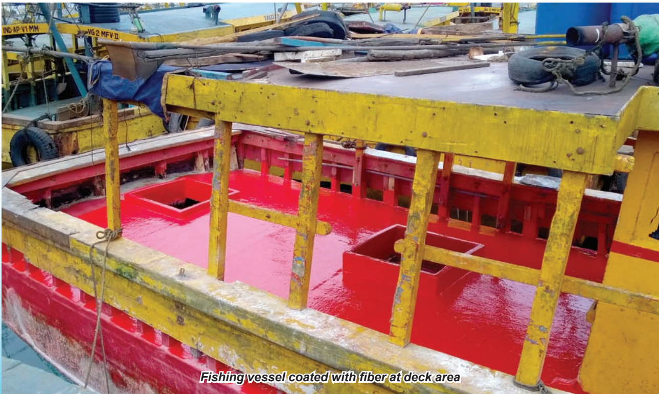
Fishing vessel coated with fiber at deck area