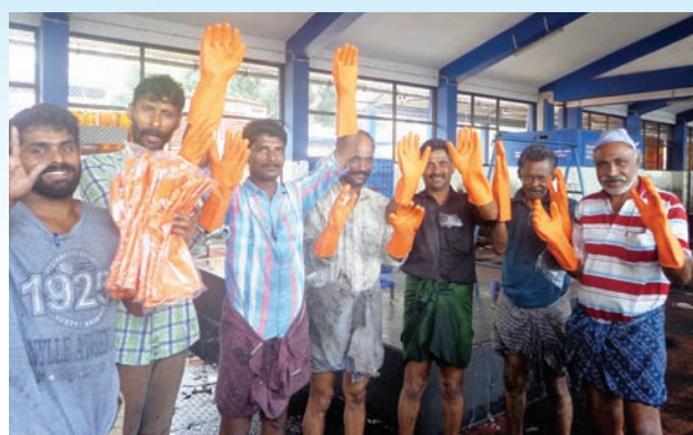
Harbour workers with gloves supplied by NETFISH