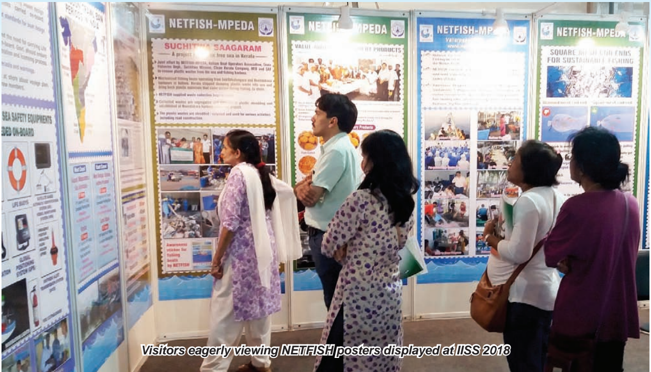
Visitors eagerly viewing NETFISH posters displayed at IISS 2018