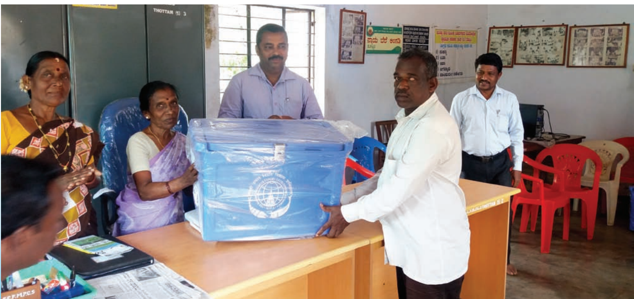
Distribution of insulated fish boxes to fishers

To impart skill-based training to the trainers of NETFISH on different aspects of packaging related to production of value added quality fish products and their preservation a training on 'Packaging of Seafood Products' was arranged in collaboration with CIFT, Kochi during 12-17 June 2017, for trainers of NETFISH including NETFISH State Coordinators and representatives from member NGOs. The trainee's folk comprised of 11 NETFISH officials and 10 member NGOs were trained in 2 batches- first batch of training from 12-14 June 2017 and the second batch from 15-17 June 2017. The programme was formally inaugurated by Dr. Suseela Mathew, Principal Scientist and HOD, Biochemistry & Nutrition Division of CIFT in the presence of Dr. K. Asokkumar, Principal Scientist and HOD of Fish Processing Division. In the 3 days training programme, Scientists of CIFT- Dr. J. Bindhu, Dr. C.O. Mohan, Dr. George Nainan, Mr. Sreejith S. and Mrs. Laly S.J. explained on the topics 'An Overview of Packaging', 'Active, Intelligent