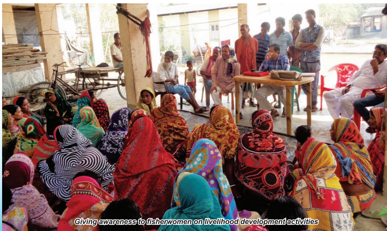
Giving awareness to fisherwomen on livelihood development activities