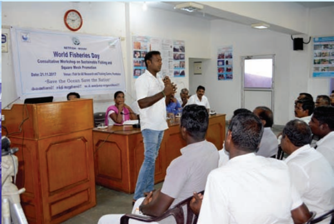
World Fisheries day programmes at Nagapattinam and Poombuhar

conservation of resources and sustainable fishing, different crafts & gears used for fishing etc. were provided in the event. All the participants equipped with cleaning tools, waste collection bags, hand gloves and caps removed plastic wastes, thermocol pieces, broken nets & ropes etc. from the harbour premises. The event opened up an opportunity for the VHSE students to know about infrastructural facilities available in the harbour, fishing boat and their utilities, different navigational equipments used in fishing boat, etc.