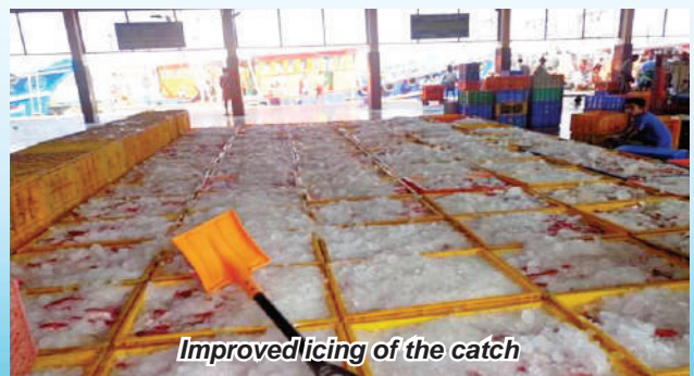
Improved icing of the catch