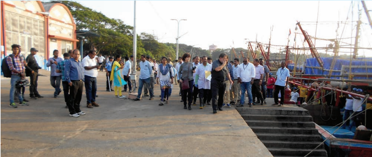
EU Mission visit at Paradeep fishing harbour

practices to be followed in fishing vessels and harbours. The trawler crew members were provided with boots, t-shirts, hand gloves and caps as part of improving the hygiene while handling fishes.