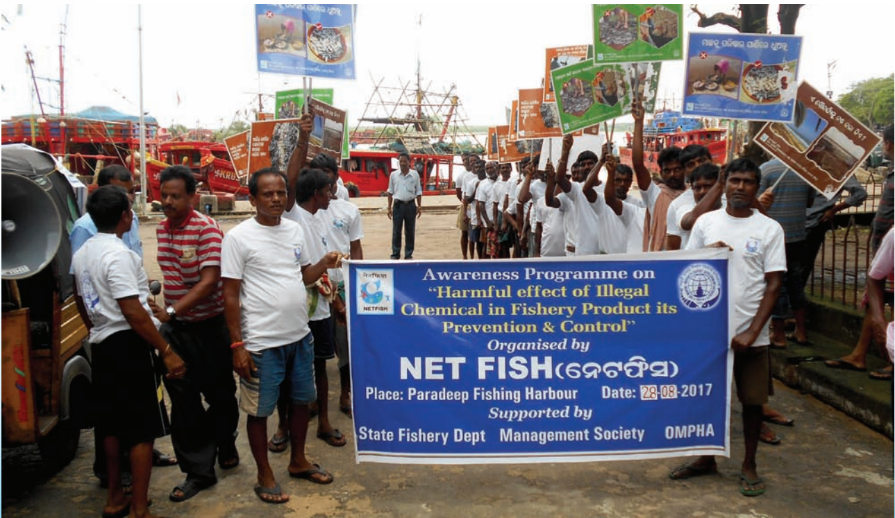
Awareness rally on harmful effects of using illegal chemicals in fish preservation

A team comprising 2 members from the European Commission visited Paradeep harbour on 21 st November 2018 and monitored the facilities and activities in fishing vessels and the harbour. As part of the visit, a special awareness programme was conducted at Pradeep on 20 th November 2017 during which NETFISH State Coordinator along with representatives of member NGO, SRMSS generated mass awareness among the fishing vessel crew, auction hall workers and supervisors on hygienic