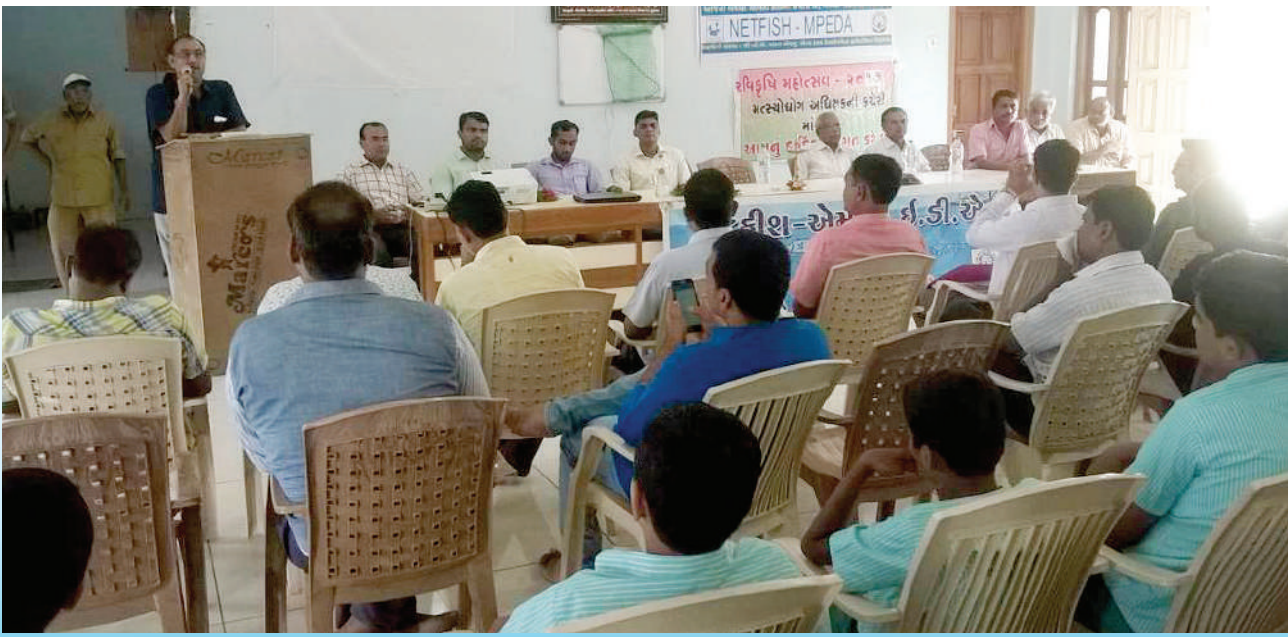
Stakeholder's consultation meeting at Mangrol on World Oceans Day

juveniles fishing. The present scenario of marine fish catch and Measures for sustainable fishing were explained in the programme the fishers were urged to stop juveniles fishing. The use of square mesh cod end in trawls to conserve the juveniles was also explained. The views of stake holders on "Moving Towards Sustainable fishing" were collected. In the end an oath was taken by all to avoid juvenile fishing and to implement 40mm square mesh cod end in trawlers.