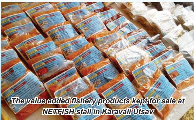
The value added fishery products kept for sale at NETFISH stall in Karavali Utsav

officials, fisher leaders, students and public visited the stall. MPEDA publications were displayed and sold and NETFISH leaflets on quality management and conservation of fisheries were distributed among the public.