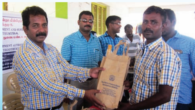
Familiarizing Tuna processing kits and its distribution to fishers