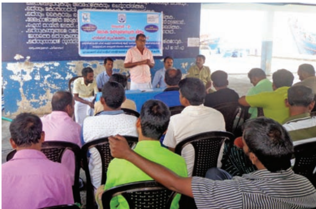
World Fisheries Day programme at Munakkkadavu

In Kerala a harbour clean-up drive was arranged at Munakkkadavu harbour jointly with fishers