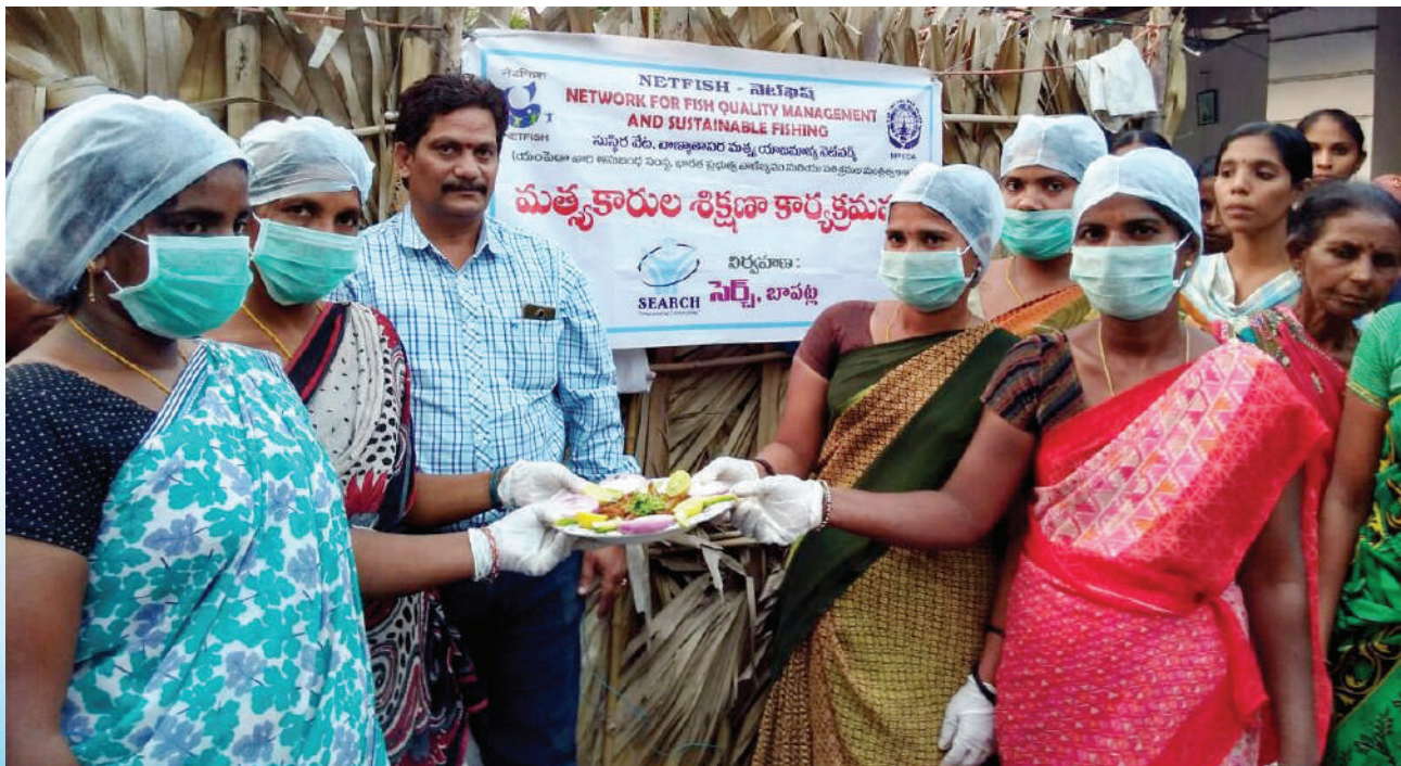
Fisherwomen in Andhra Pradesh with the finished product during value addition training