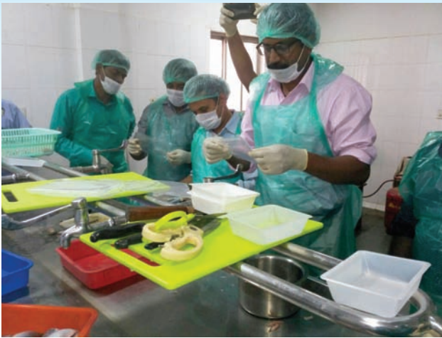
Trainees get hands on training on packing at CIFT

and Modified Atmosphere Packaging’, ‘Handling & Chilled Storage of Fish & Fishery Products’, ‘Testing & Safety of Packaging Materials’ and ‘Significance of HACCP’ respectively. The scientists along with Technical staff practically demonstrated the various packaging methods, testing of packaging materials, fish fillet preparation, preparation of fish finger, fish balls, fish cutlets etc.