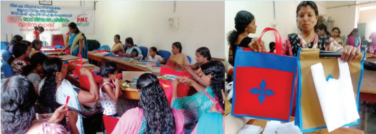
Fisherwomen of Alappad getting trained on production of eco-friendly bags

Out of the three livelihood development programmes organized in Kerala, two programmes were conducted at Thottappally and Ambalappuzha for fishermen Society in collaboration with CIFT, Kochi. More than 40 beneficiaries participated in both the programmes and they were introduced to different fish based livelihood options such as preparation of dried fish, battered and breaded products, manure making etc. Another livelihood training programme organized at Alappad, Kayamkulam was focused on skill development for preparation of Bags and Big shoppers by using paper material. This programme was jointly organized with Alapped Grama Panchayath and Coastal Police Neendakara which benefitted the women groups from the nearby fishing villages.