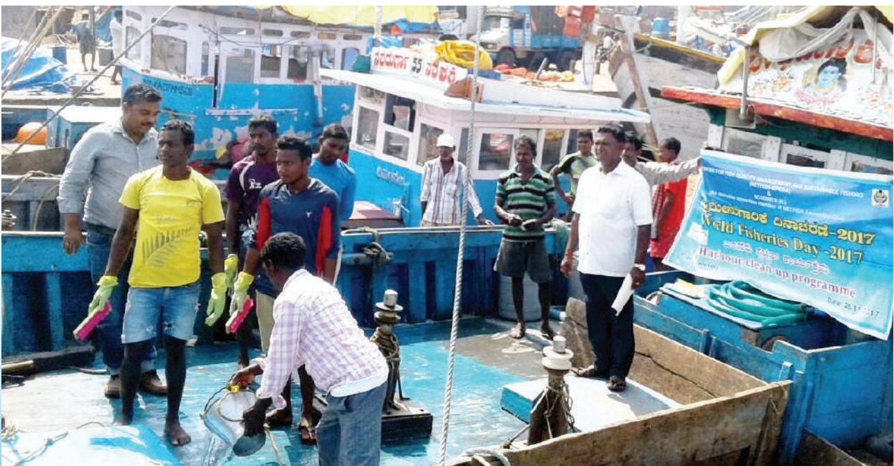
Boat clean-up demo at Belekeri

The beach clean-up programme conducted at Dahanu, Palghar district with the support of MVSS, Thane and Agricultural & Technical Vidyalay, Kosbad had participation of 20 students and teachers. They collected monofilament net pieces, thermocol, plastic bags, bottles, etc.