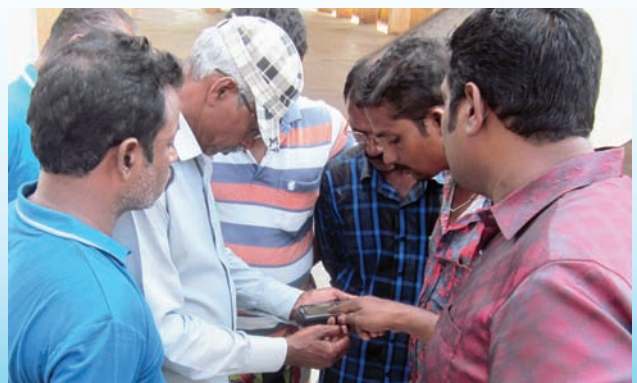
Hands on training to fishers on use and troubleshooting of GPS device