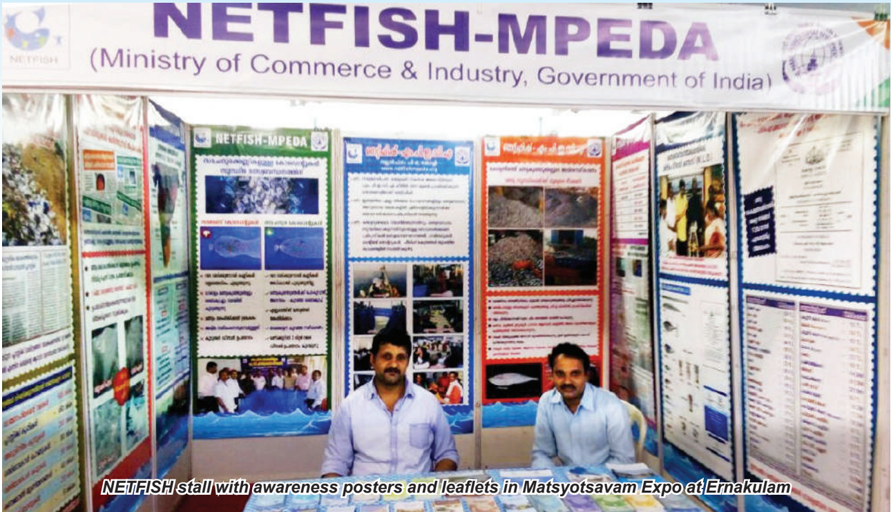
NETFISH stall with awareness posters and leaflets in Matsyotsavam Expo at Ernakulam