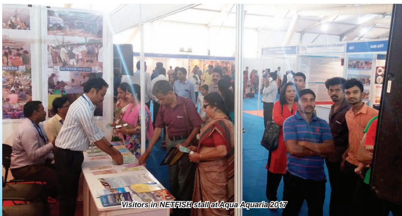
Visitors in NETFISH stall at Aqua Aquaria 2017

Albertian International Education Expo 2018: A stall was set up by NETFISH jointly with MPEDA Regional Division, Kochi in the 'Albertian International Education Expo' organized by St. Albert's College, Ernakulam during 4 th to 6 th January 2018 inside the college campus. The stall displayed various awareness posters of NETFISH, mostly on hygienic handling of fish and conservation of fishery resources. Brochures and leaflets depicting information on Aquaponics, nutritional value of fish, fish handling procedures, fishery conservation measures were kept for distribution among the needy. Students of the college as well as students from nearby educational institutes visited the stall and many of them showed keen enthusiasm in gathering information about our activities.