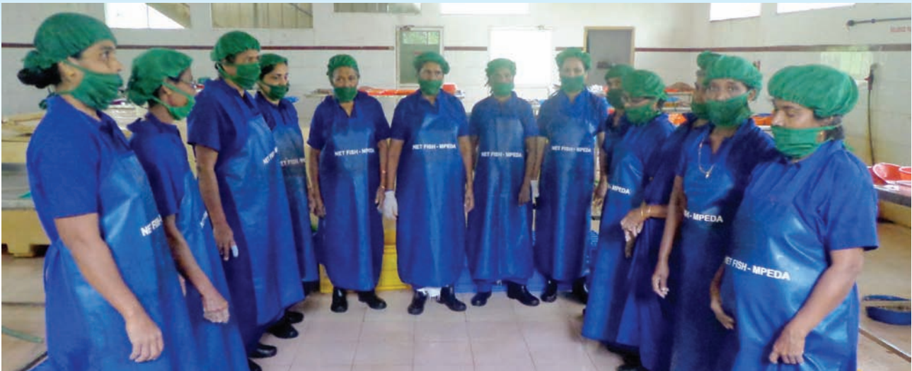
Pre-processing workers wearing the uniforms provided by NETFISH

were arranged for the workers, Technologist and Supervisors of Pre-processing centres. Practical demonstrations of change room activities, hand washing procedure were also done in the programme with the aid of NETFISH leaflets, posters and movies. Aprons, uniforms, caps, mouth cover and gum boots were distributed to pre-processing workers in selected PPCs using the stipend money. After attending the training programmes pre-processing workers have gathered knowledge on hygiene & sanitation practices and are maintaining better personal hygiene.