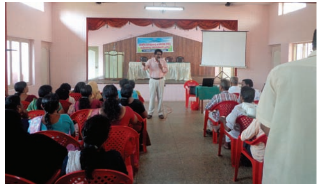
NETFISH CE delivering a class on responsible fisheries and KMFRA in the FMC meeting

conducted a series of awareness programmes on formation of Fish Management Council in which NETFISH was specially invited to deliver awareness classes regarding responsible fisheries and KMFRA. The programme held at Kozhikode, Eravipuram, Vadi, Neendakara and Payyoli were attended by CE NETFISH and State Coordinator. CE talked about the ill effects of cases of destructive fishing and the need to follow KMFRA amendments in the current scenario. SCo described the need of responsible fishing and various regulations followed for responsible fishing. The programme was attended by over 100 people including fishermen and women.