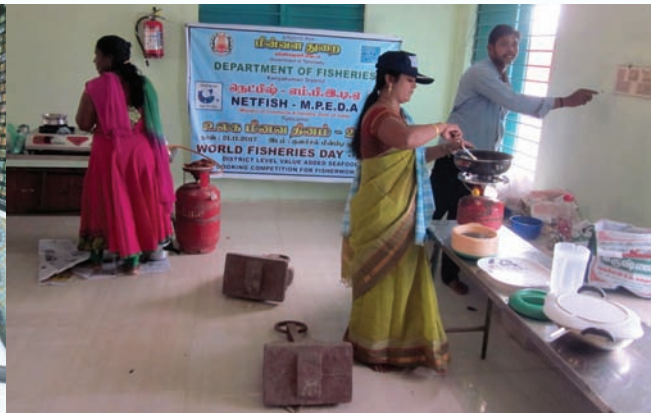
Exhibition stall at Colachel harbour & Fisherwomen from Kanyakumari participating in cooking competition