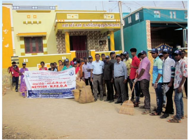
Harbour Cleanup at Punnakayal

to mark a model for the fisherfolk. Cleaning kits such as hand gloves, jute gunny bags, brooms, bamboo baskets, buckets, bleaching powder and disinfectant was provided. The participants along with local public went on for a procession through the village chanting slogans against marine pollution. The volunteers were divided into two groups - Group A cleaned the FLC by sweeping and removing physical debris, washing with clean water and disinfecting with bleaching powder and Group B collected debris from around the FLC which comprised mostly of plastic carry bags, nylon ropes, plastic cement bags etc. At the end of the cleanup