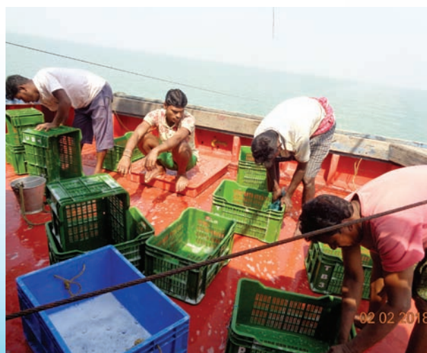
Fishers given training on proper cleaning of utensils

Onboard programmes were aimed to render awareness and practical training to the boat owners, fishermen, boat crew members and workers about hygienic handling of fish and ice onboard and also about sustainable fishing practices and use of life saving equipment. The programmes included classes, demonstrations and subsequent discussions with trainees regarding various quality problems onboard. Leaflets and posters pertaining to hygienic handling practices onboard fishing vessels, responsible fishing etc. were explained and distributed to the trainees and short videos relevant to the subjects were also shown. Fishermen aid materials such as Life jackets, Plastic shovels, Plastic baskets etc. were also provided during the