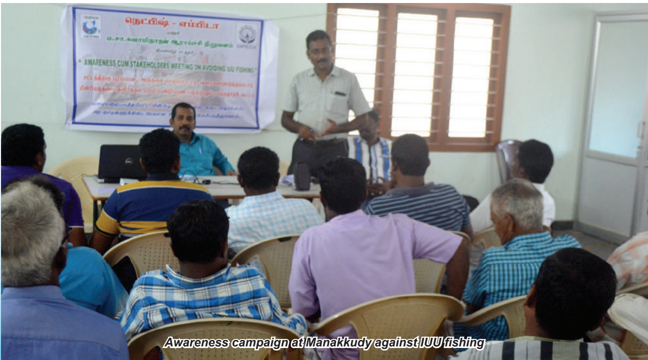
Awareness campaign at Manakkudy against IUU fishing