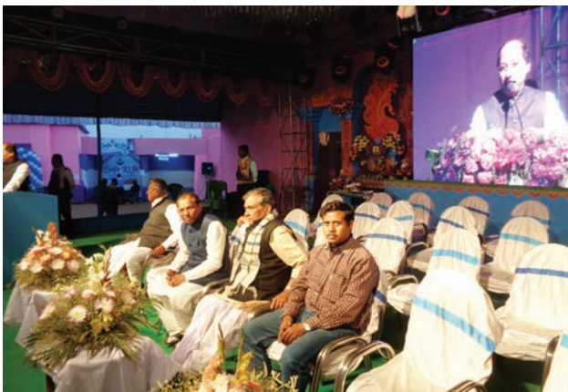
NETFISH State Coordinator on the dias along with other dignitaries in the Sea Food Festival