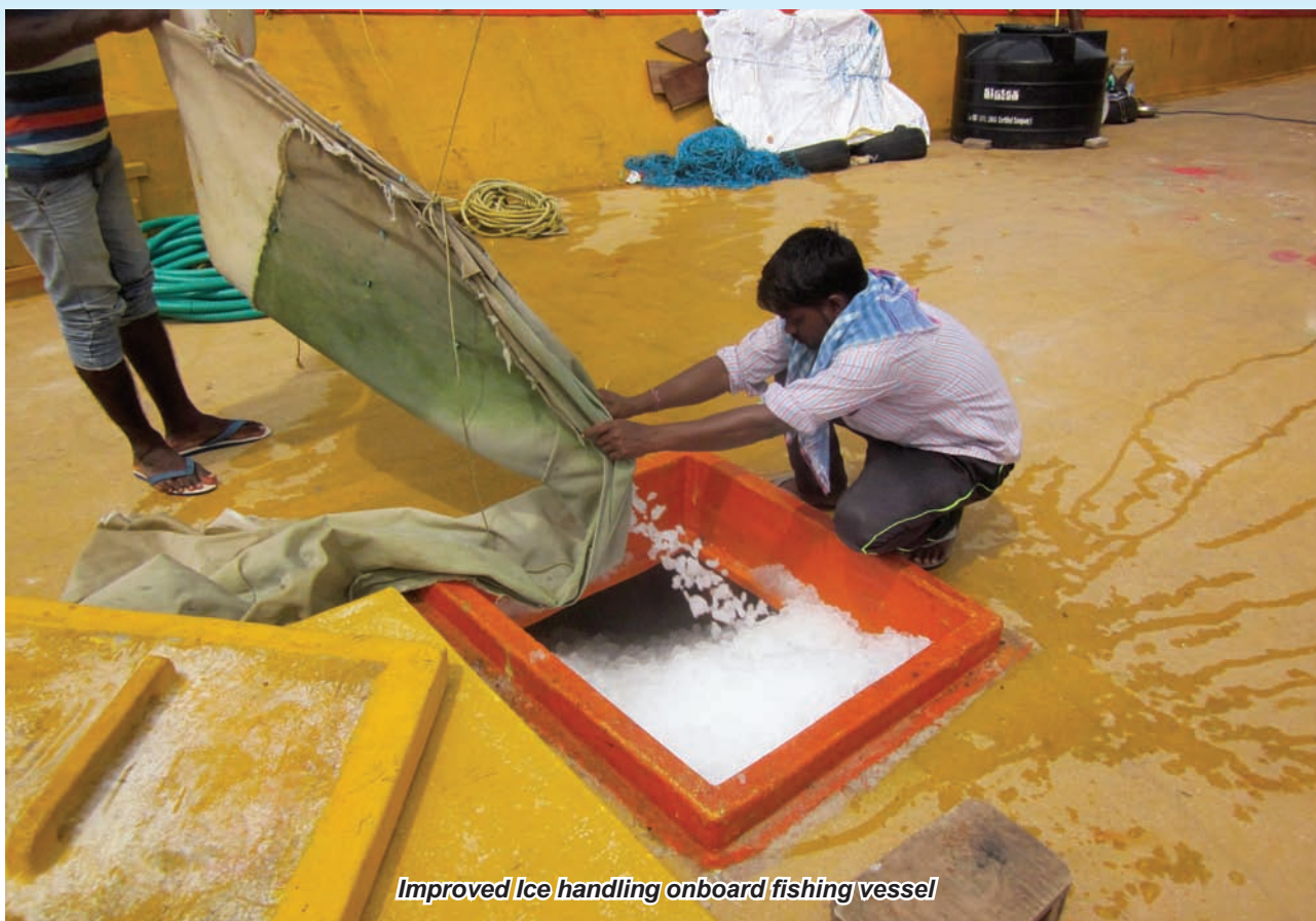
Improved Ice handling onboard fishing vessel