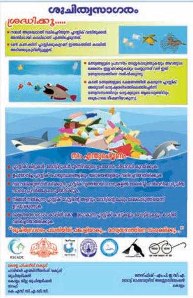
Awareness Sticker by NETFISH for pasting in fishing boats