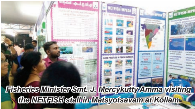
Fisheries Minister Smt. J. Mercykutty/Amma visiting the NETFISH stall in Matsyotsavam at Kollam