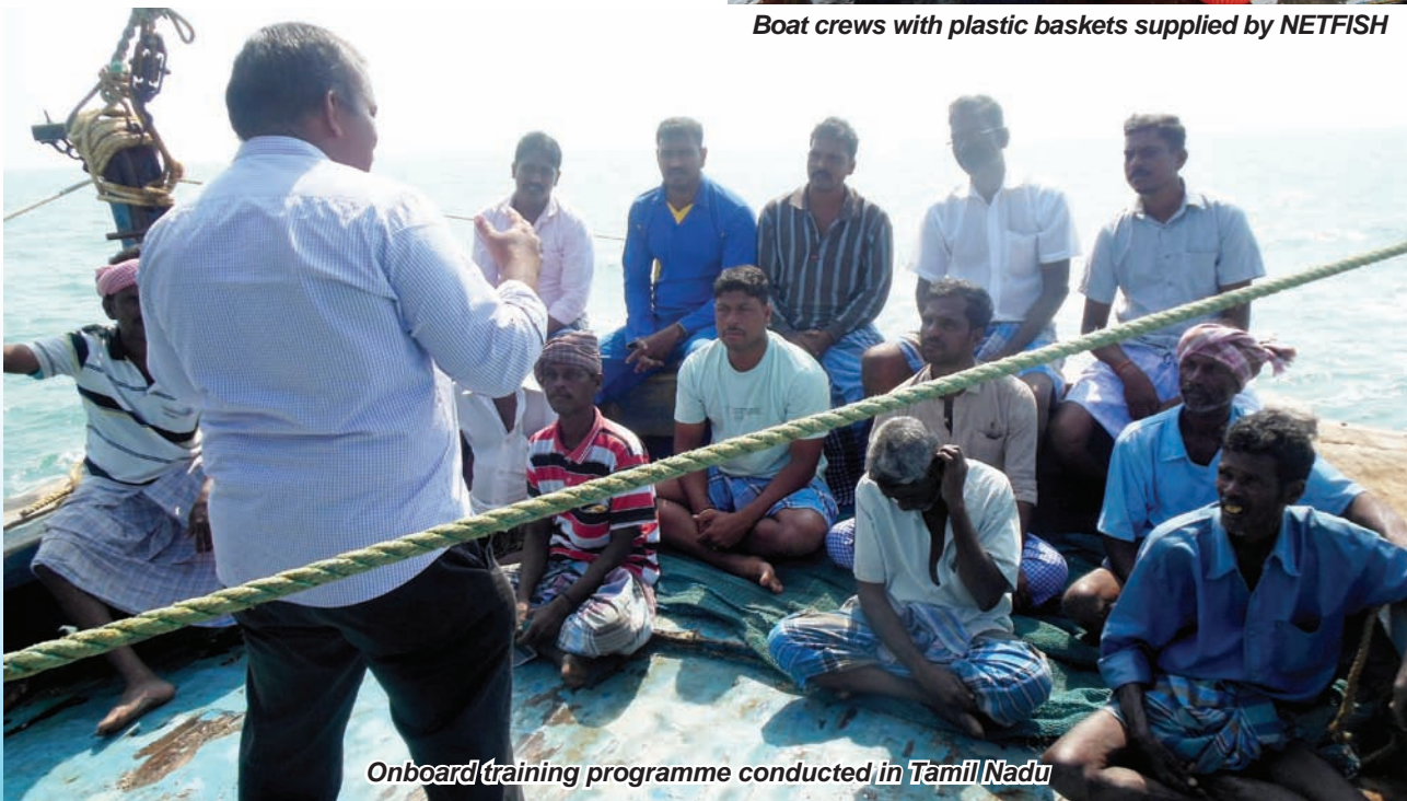
Onboard training programme conducted in Tamil Nadu