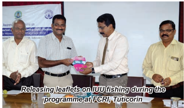
Releasing leaflets on IUU fishing during the programme at FCRI, Tuticorin