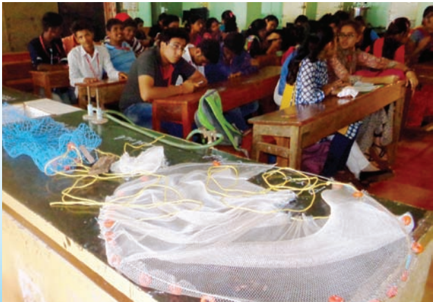
Fishing net models displayed during VHSE programme in Maharashtra