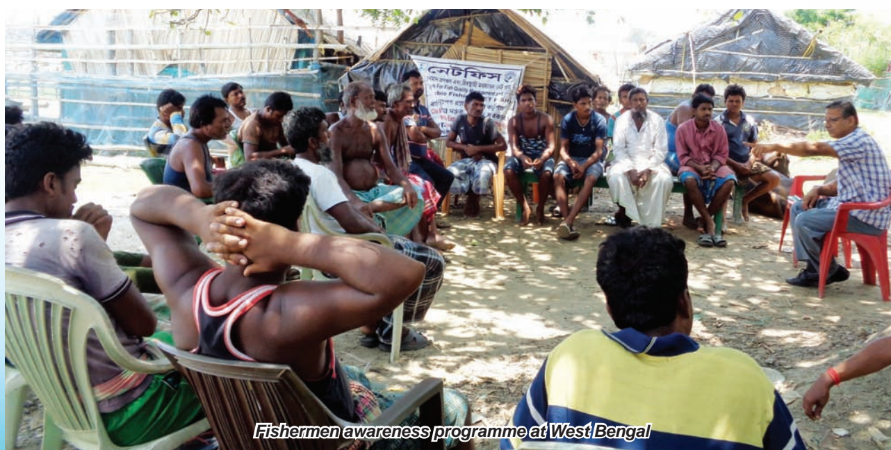
Fishermen awareness programme at West Bengal