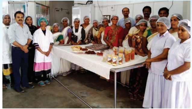
A view of the participants of the training programme organized at NIFPHATT, Kochi