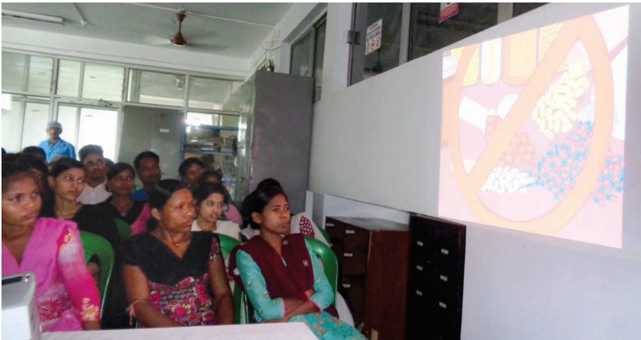
Processing workers watching NETFISH awareness video

abuse of antibiotics were given. Film on sanitation and hygienic practices in seafood processing centre was shown to the participants and posters and leaflets were distributed and explained to them in the programme.