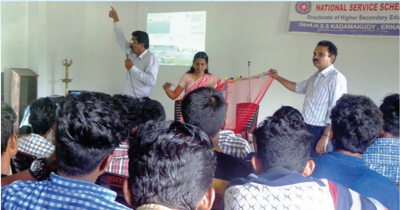
Awareness programme for students at VHSE, Kadamakkudy